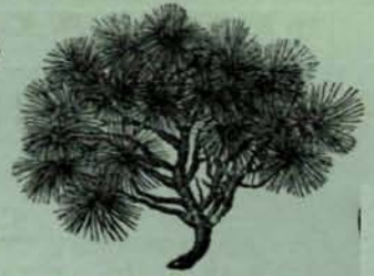
THE SNOW-GROWN PINUS PUMILIO.

LARYNGEAL CATARRH, BRONCHIAL and PULMONARY AFFECTIONS, RHEUMATISM, GOUT.