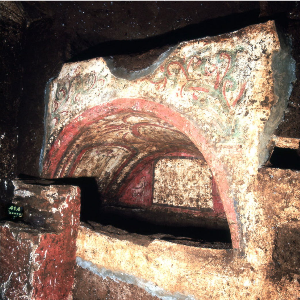
Fig. 4. Arcosolium painted with rectangular framed panel for attachment of a portrait on cloth, with nails preserved around the edges, SS Marcellino and Pietro.

therefore difficult to study. To date, research into ancient painted portraiture in these media has followed two main trajectories: study of the Fayum mummy portraits, and the relationship between panel portraits and icons. 7 Both early icons and mummy portraits have primarily been preserved in the dry climate of Egypt. This limited preservation context has narrowed the scope of research into painted portraiture, which is regrettable given that it was a common form of representation across the empire. The Fayum portraits in particular captivate modern viewers, but they represent only a fraction of the painted portraits that