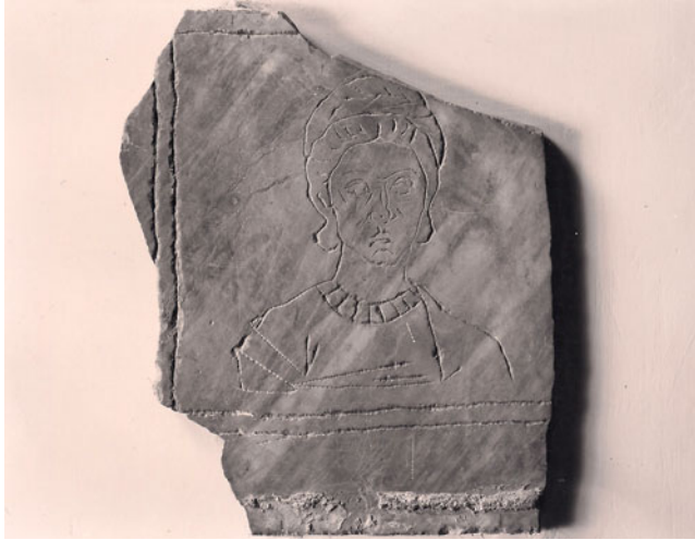
Fig. 9. Incised portrait in imitation of a painted panel portrait, from a fragmentary loculus cover in the catacombs of S. Callixtus.

elegant details of her face and the frame that surrounds her bust both indicate that this image was intended to imitate a painted portrait panel, just like those we find in fresco. 79