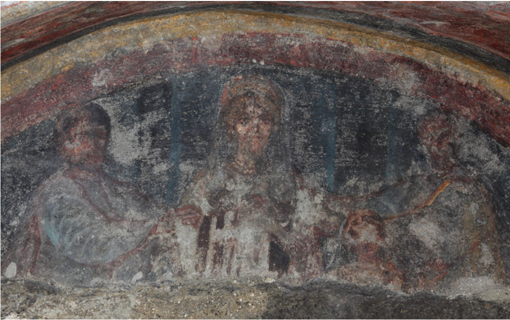
Fig. 12. Detail of the arcosolium tomb painting of a woman and her daughter from the catacombs of S. Tecla, with blue panels framing the adult figures.

its technical qualities. 110 Blue and green were regularly included in paint mixtures for flesh colors, used to impart realistic ‘cool’ tones to skin. The widely used Egyptian blue, for example, has been identified in flesh areas on panel portraits, free-standing sculpture, and sarcophagi. 111 Once thought to have been forgotten by Late Antiquity, imaging techniques now show that Egyptian blue was used well into the Middle Ages. 112 Blues and greens were also common components of underpaint for flesh tones for the same reasons that they were mixed into flesh-colored paint. 113 A portrait required large areas of the composition to be painted with flesh tones, and a blue ground may have provided an appropriate base color. Blue pigments derived from rare minerals like lapis lazuli were probably prohibitively expensive for such use, but the ubiquity of synthetic Egyptian blue suggests it was not costly. Analysis of mummy portraits from the Phoebe A. Hearst Museum of