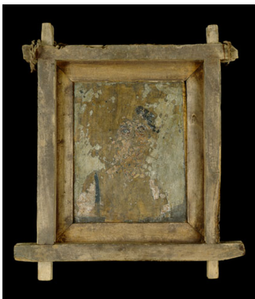
Fig. 5. Framed wooden panel portrait from Hawara, Egypt, 1st c. CE?

decorative media. The painted interior of a late 1st-c. CE sarcophagus from Kerch shows a scene of a portrait painter in his workshop. He has paintings on his easel and completed pieces on the wall. 22 In Antioch a mosaic from ca. 200 CE depicts a young man contemplating a small, framed portrait of a woman, perhaps an image of his beloved. 23 The panel is similar to the only complete framed portrait to survive from antiquity (Fig. 5). 24 Found propped against a mummy in Hawara – presumably acting as a pseudo-mummy portrait – the painting itself is badly preserved, but the frame is in good condition with a rope for suspension. Unlike other mummy portraits, there can be little doubt that this painting originated in the home of the deceased.