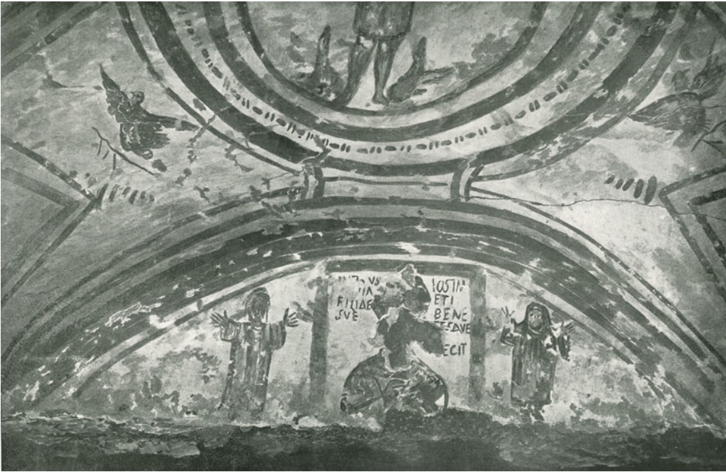
Fig. 6. Bust portrait of a woman with a painted frame, Coemeterium Maius. (Wilpert 1903, pl. 223.)