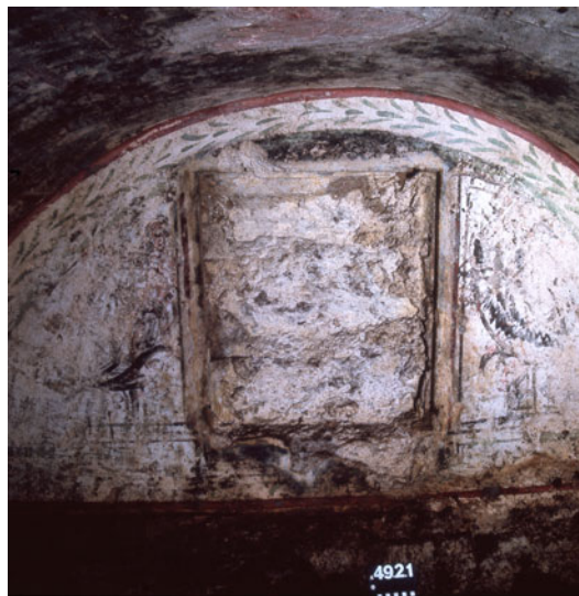
Fig. 3. Recess for a panel painting(?), SS Marcellino and Pietro.

portrait on cloth but was also depicted inside a rectangular painted frame that imitated a panel painting. Looped pieces of string were even painted protruding from either side of the frame, mimicking the cord used to hang a painting on the wall.