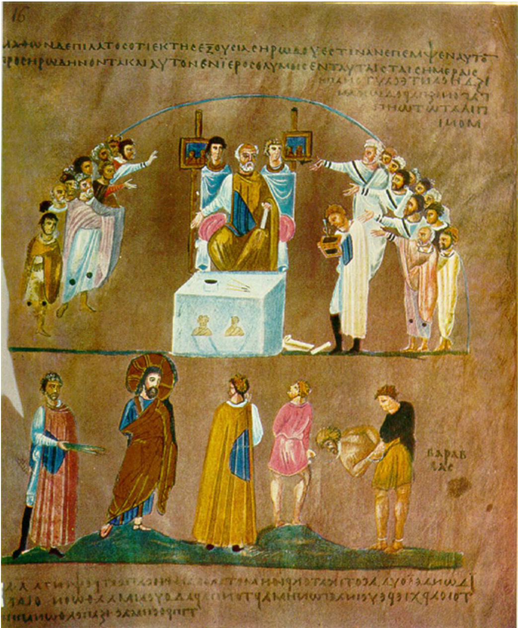
Fig. 11. Christ before Pilate, with framed portraits of emperors in the background, Rossano Gospels, 6th c.

white lines and makes an emperor...". 109 While Chrysostom is talking specifically about imperial portraits, the visual evidence suggests that blue was a common ground color, perhaps so common that a simple blue rectangle could come to stand for a portrait panel and carry its symbolic connotations. It is unclear why blue was popular, but it may be related to