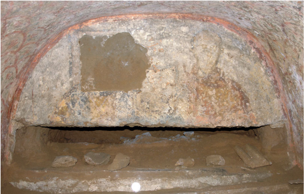
Fig. 2. Composite family group portrait from the catacombs of Domitilla.