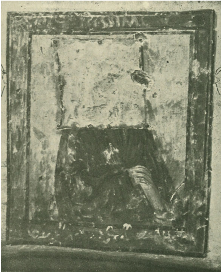
Fig. 1. Composite portrait from the Crypt of Oceanus in the catacombs of S. Callixtus. (Wilpert 1907, fig. 3.)

recently begun to receive detailed investigation and are still overshadowed by biblical motifs. 4 “Multi-media” funerary compositions like those described above have attracted limited attention, largely due to their peculiarity. 5 This is unfortunate, since in addition to these composite images which utilized wood or cloth, many more funerary portraits in various media imitated or referenced the use of panel portraits, thereby attesting to their desirability for funerary commemoration. This was mainly achieved through the addition of painted frames. 6 For example, the bust from S. Callixtus incorporated a facial