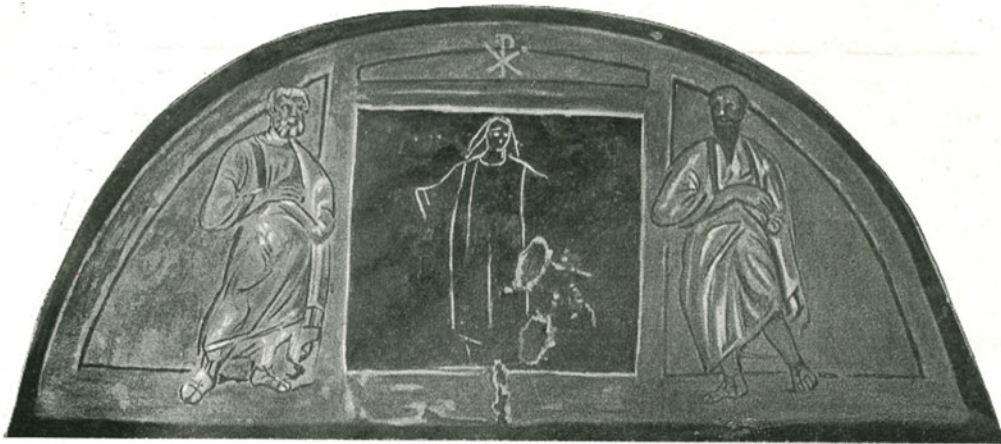
Fig. 7. Framed portrait in an arcosolium in the catacombs of Domitilla, flanked by Peter and Paul. (Wilpert 1903, pl. 154.1.)

flanked by Peter and Paul, the other by Cupids (Figs. 7–8). In the former, there are traces of the depiction of a single orant individual and in the latter, a couple can still clearly be seen. 74 Several other portraits were executed within round frames imitating tondi, the best preserved of which is the bust portrait of a young boy from arcosolium 67 in the