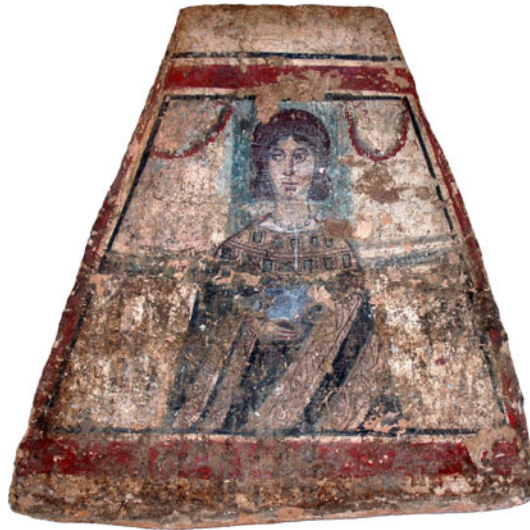
Fig. 13. Portrait of the deceased lady, western wall of the Pagan tomb (G2624) from Viminacium, documentation of the Institute of Archaeology. (Belgrade, Project Viminacium.)

Anthropology has proved the use of Egyptian blue as a toning agent in backgrounds that appear grey to the naked eye. 114 Light grey to greyish-blue are common backgrounds on surviving mummy portraits and other panel paintings, and may represent a more toned-down version of what we see in representations of paintings in other visual media. 115