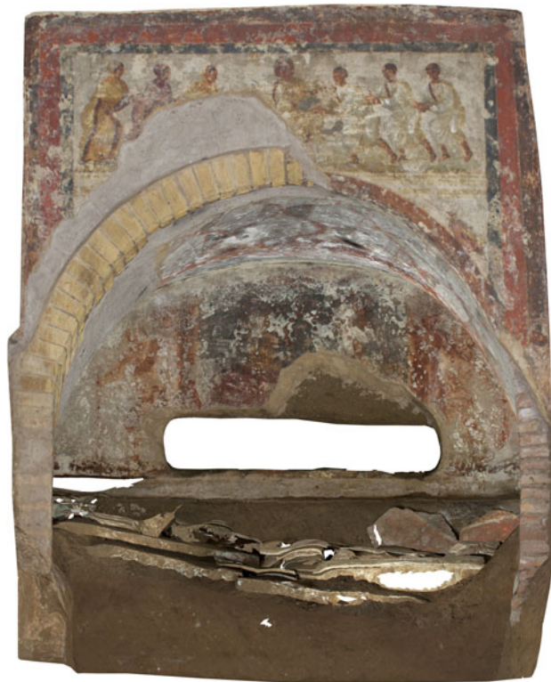
Fig. 8. Framed painted portrait of a couple in an arcosolium in the catacombs of Domitilla, flanked by Cupids (white sections are in the image as provided).

catacombs of Domitilla. 75 A beautiful pair of tondi representing a couple from the cimitero di Ciriaca also belong to this group, but were executed in mosaic. 76