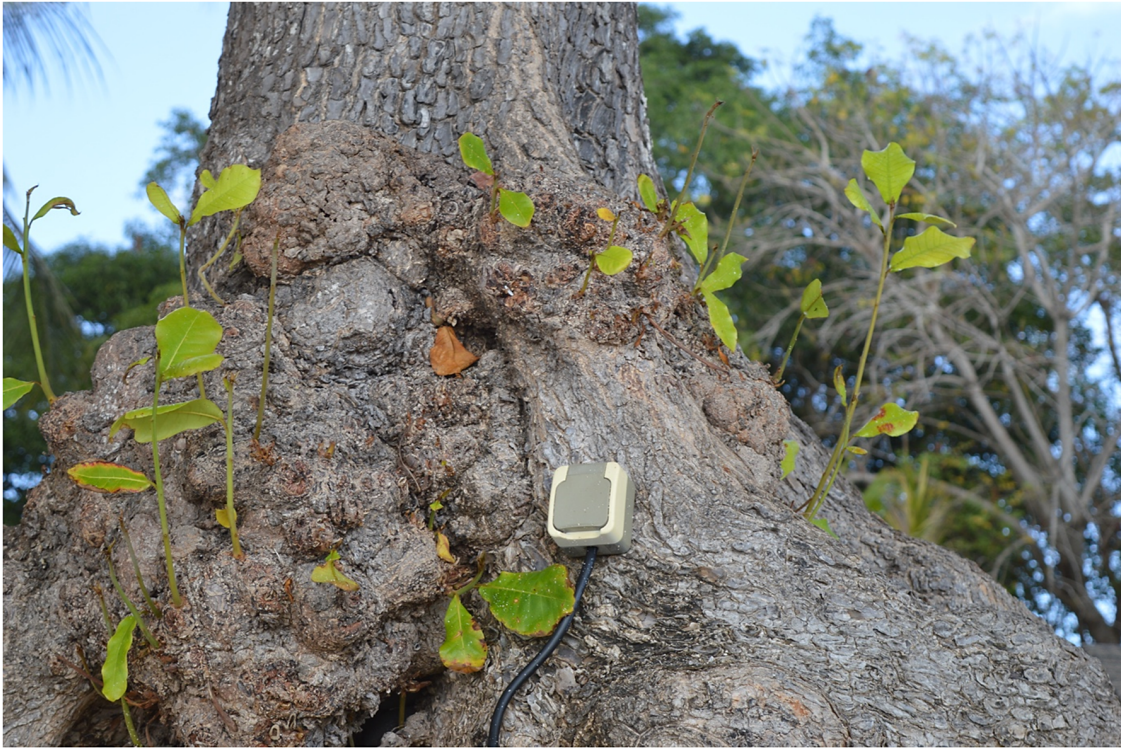
Figure 1. Reductionistic versus systemic views on plants: Should we use plants to feed our needs, or should we use plant lessons to question our choices?

meaning that they waste more than 98% of solar energy to produce their remarkable seeds and leaves (Arp et al., 2020). This does not fit the optimisation narrative.