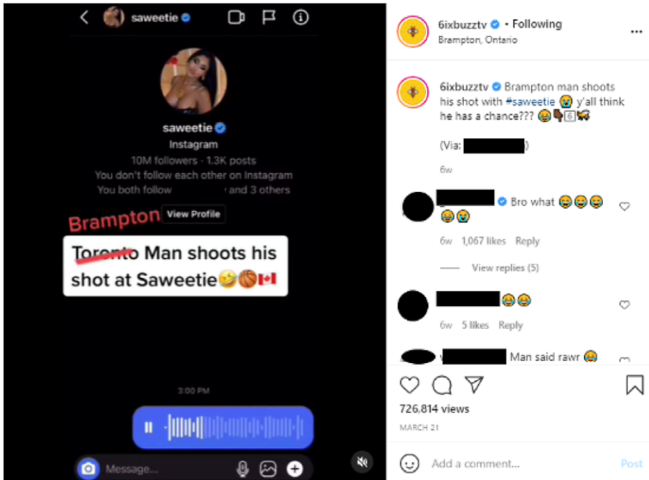
Figure 1. Screenshot of Brampton man shoots his shot

direct messaging (DM) on social media apps. 11 In this case, the message is left for the popular American rapper Saweetie. As seen in figure 1, the post itself is a screen-captured video showing the sender’s DM history with Saweetie. The single message in the chat history, the voicenote, can be seen playing; text is overlain which reads ‘Brampton Tøɾəntø Man shoots his shot at Saweetie 🏀🇨🇦’. The speaker himself, who is tagged in the caption, appears to have posted it on his own account for comedic purposes; 6ixBuzz has added the overlain text. A transcript is given below in (1).