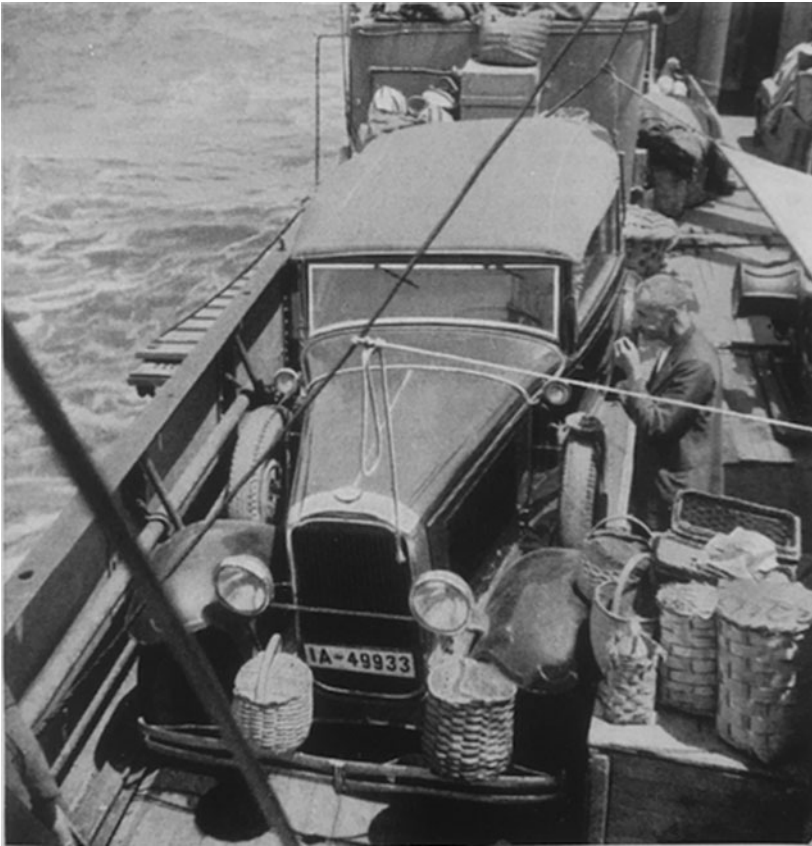
Fig. 2. “Bungo” journeying across the Black Sea between baskets and chickens.