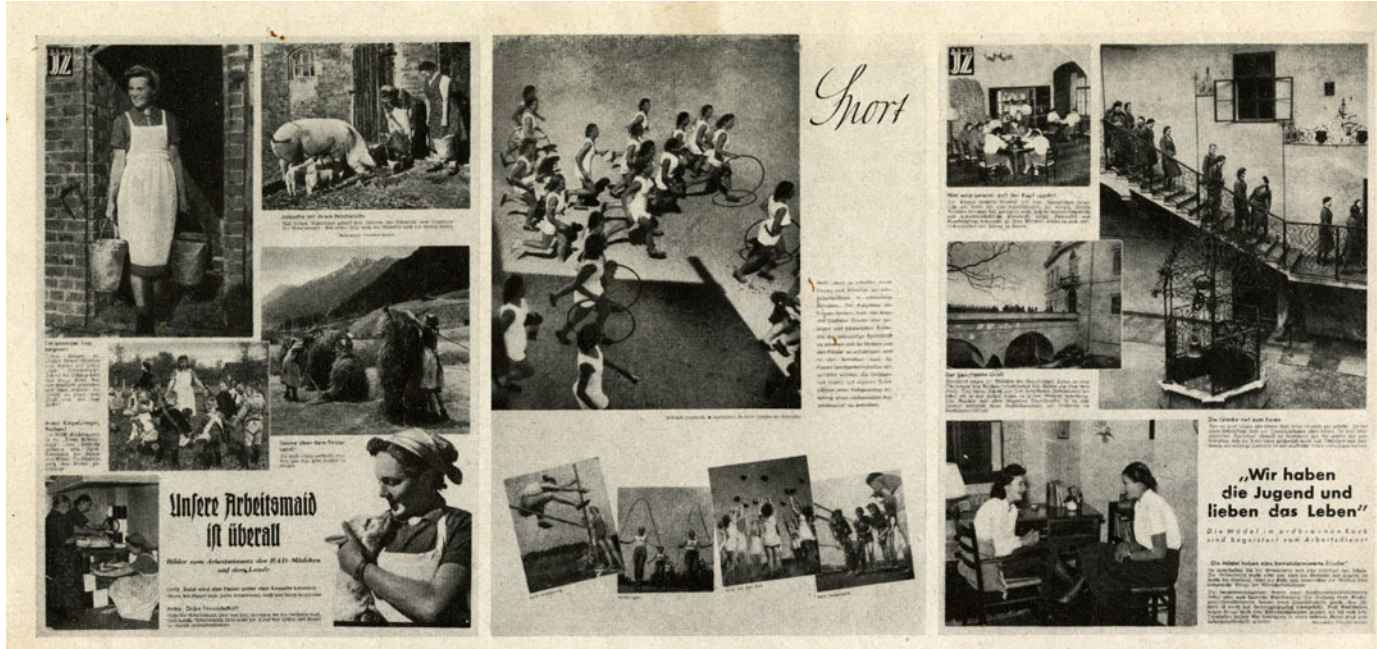
Fig. 5. An excerpt from Willy Stiewe's article, showcasing various examples of Liselotte Purper's photography.