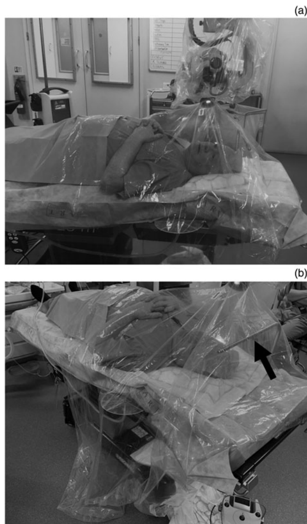
Fig. 2. Example setup of the novel drape 'tent'. The assembled drape 'tent' that was used for the paediatric patient has been recreated for illustrative purposes with the second author in place of the patient. (a) The CE marked sterile polyethylene drape (intubation drape shield with endotracheal tube access (product reference: VED5010A); Vital Care Industries) is attached to the lens cap of the standard sterile microscope drape (Glass Lens Micro-Kover (product reference: 09-GL902); Advance Medical Designs). The drape 'tent' is then extended to cover the entire surgical field. (b) The drape 'tent' is supported by an 'L' support (black arrow) at the head of the patient. During the mastoid surgery described in this case report, this 'L' support was covered in a sterile camera drape with ring applicator (product reference: 202-02; Delta Surgical).

The microscope (Opmi Vario/S88; Zeiss, Jena, Germany) was initially covered with a standard sterile microscope drape (Glass Lens Micro-Kover (product reference: