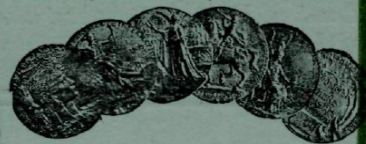
Gold Medal (Highest Award), Allahabad 1910.

GRANDS PRIX: Paris 1900, Brussels 1910, Buenos Aires 1910