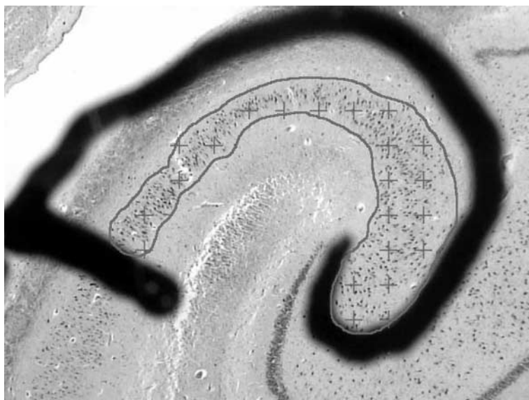
Fig. 1 Hippocampal region CA2/3 with superimposed raster sampling pattern.

the intensity of the sampling). Neuron density ( N_v ) was counted in a mean 57 dissectors and volume density ( V_v ) was assessed with a mean 88 frames per case; a mean of 89 neurons were counted for N_v , and a mean of 135 points were counted for V_v estimation per case. At each such point a plane within the section was brought into focus, and an array of 36