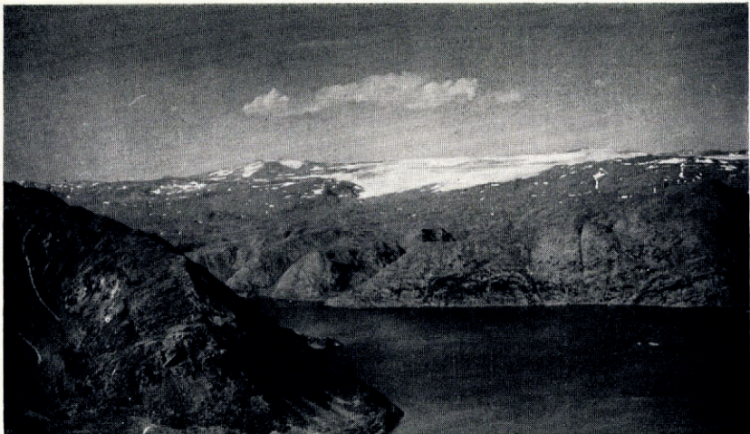
Fig. 2. Seilandsjøkulen from the south-east, showing the southern lobe from the summit of the cap to its outlets. The lower part of the northern lobe can be seen in the right centre of the picture.