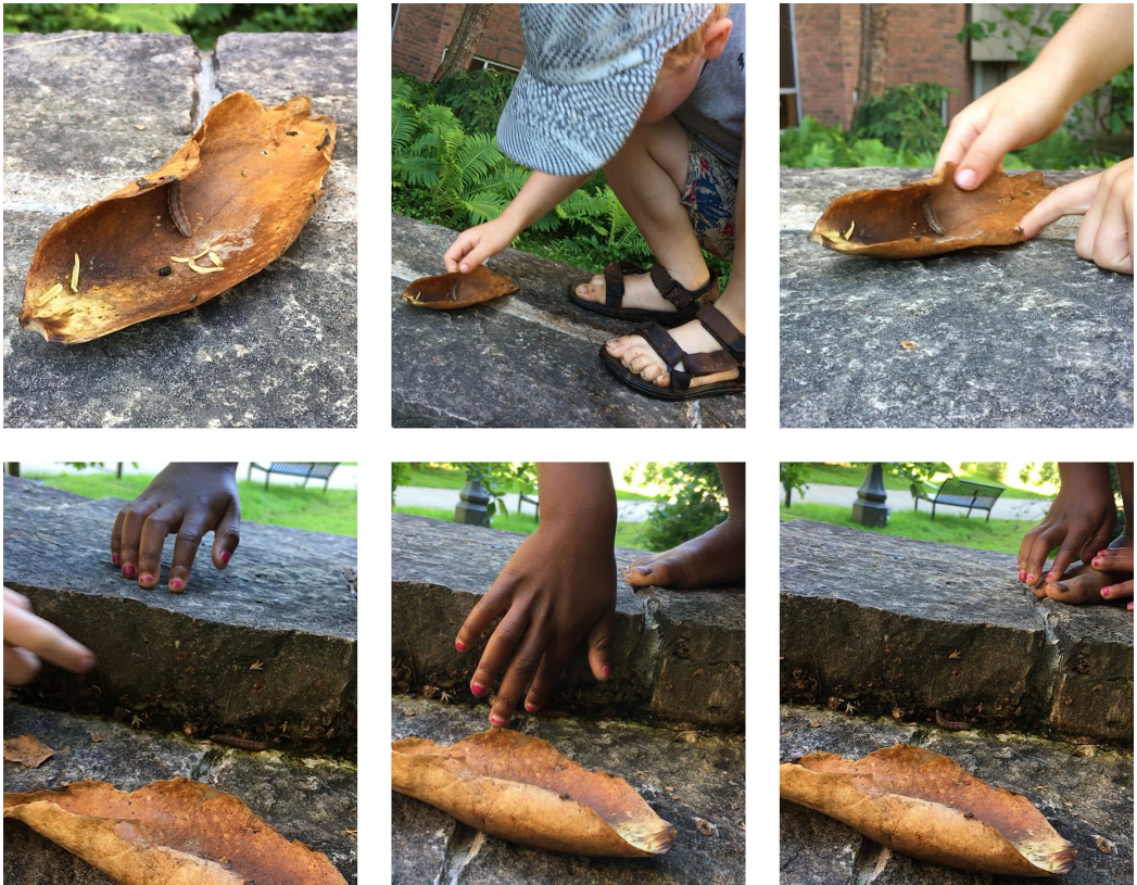
Figure 1. Caterpillar encounters.