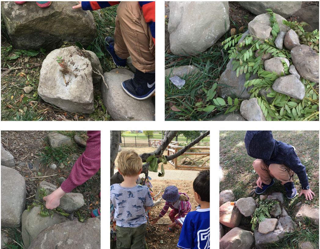
Figure 8. Making toad houses.

I had proposed developing a curriculum for this group based upon my observations of their building small toad refuges all around the playground (see Figures 8 and 9). During my initial observations, I noted misconceptions that the children had about toads, prompting me to gather non-fiction literature about toads to share with them. This information intrigued the children and