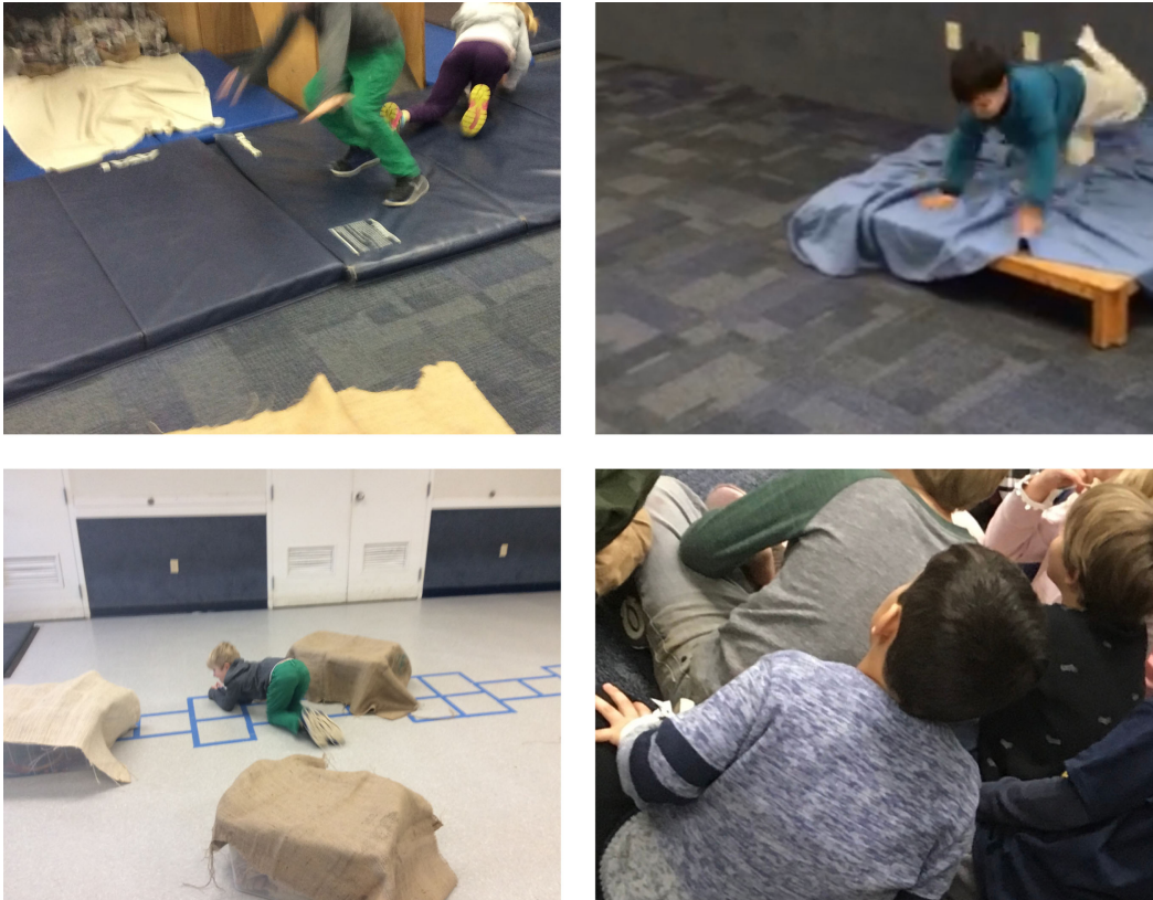
Figure 10. Toad play-stories.

playground where many of the children shared in these play-stories, collectively thinking-with toads and having conversations that integrated language related to toads' instincts, habitats and lifestyles.