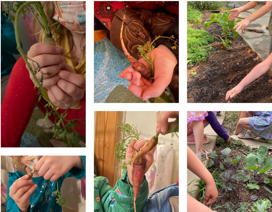
Figure 7. Carrot Rapunzel.