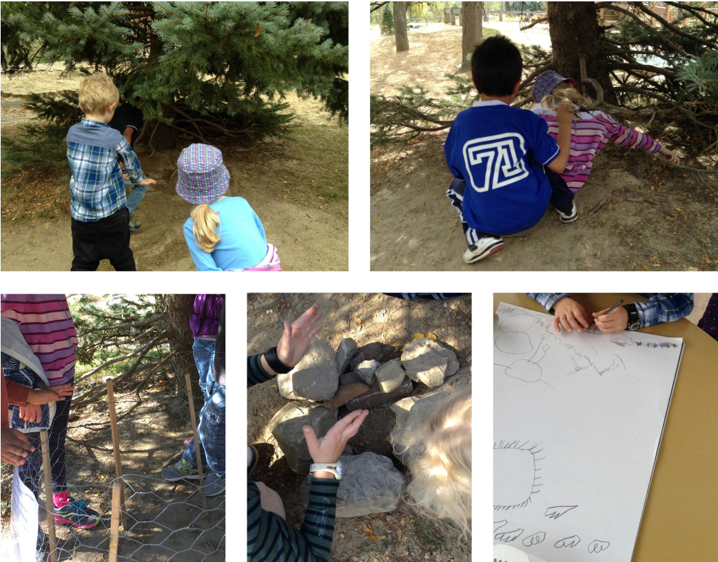
Figure 9. Collecting and arranging.

they began expressing a desire to “become toads.” With this shift of interest—from educating others about caring for toads to becoming toads themselves—I began to share videos of toads with the children, giving them opportunities to see a toad’s camouflage and movements in different environments, and hear the different sounds toads make to call one another. This movement fostered the children’s relationality with toads—and they began to practice hopping, changing the ways in which they vocalised when calling to each other, and finding ways to camouflage with/in their surroundings. We transformed the school’s gross motor gym into a toad space, collecting outdoor materials, using crates and fabrics to make “tall grasses” and potato sacks as “burrowing spaces,” draping blue and brown fabrics for “ponds and muds,” and arranging tree cookies for the children to hop to and from. The children were becoming toads, eventually calling themselves Toad A, Toad Z, Toad E and Toad B instead of their human names. We noticed the ways in which they leapt from their “hind legs” to land on their “front legs,” their deep, full-throated calls to one another, and the different ways they travelled through the muds, grasses and waters. These embodied practices of thinking-with and moving-as toads provoked them to begin exploring dramatic play as toads, to act out toad stories. My assigned role in this play/storytelling was typically that of a predator, most often a snake.