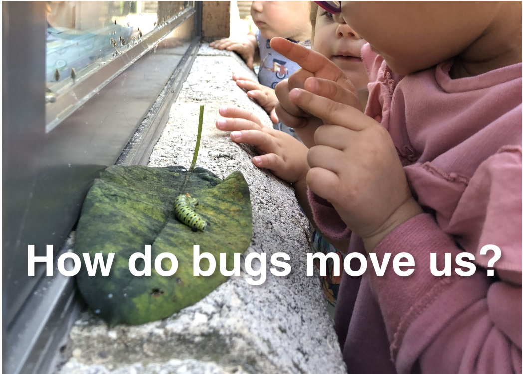
Figure 2. A photographic panel, showing children engaged with various bugs on an outdoor window ledge, with text reading, “How do bugs move us?”

Within the context of the United States in particular, what is accepted as early childhood “best practice” serves to uphold the binary between human and other non-human “things.” This is especially persistent with regard to young children’s engagements with plants and animals; these are conceptualised as instrumental matters, wherein children are hyperautonomous individual learners (Prout, 2005) and non-humans are relegated to the passive tools for children’s science learning (Myers, 2018). But I was struck by adults’ seeming inability to read the question as it was written. My question was intended to be an inquiry into our relationships with creatures, but it was being read as a test wherein animals were the object of study and the correct answers could be performed by children. Was this intentional? It happened so often that it seemed like a case of particularly humanist pareidolia —the phenomenon wherein we perceive something ambiguous as something familiar, such as seeing a dragon in the clouds or a human face in a rocky cliffside. I had anticipated that some might not want to engage with the question. But I had not expected that the workings of anthropocentrism would be highlighted in this way, so persistent that it was rearranging words somewhere between the way they were written on the page and spoken aloud and perhaps so stealthily that the reader wasn’t even aware of the shift that had taken place.