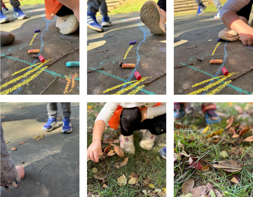
Figure 3. Perhaps.

Perhaps , Rachael, early years and art teacher (see Figure 3)