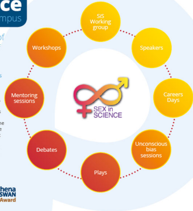
Fig. 1. Athena SWAN and SIS information included in the induction pack (front page).