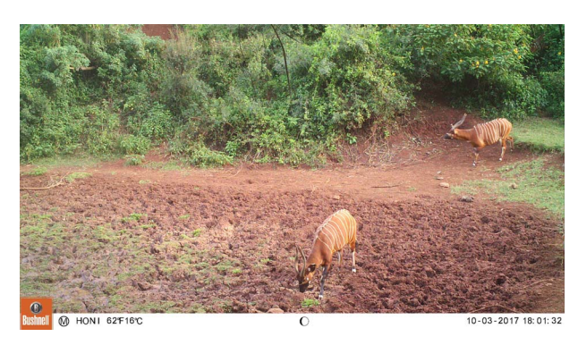
PLATE 1 The mountain bongo Tragelaphus eurycerus isaaci recorded by a camera trap at a salt lick in the Salient area of Aberdare National Park, Kenya. The Bongo Surveillance Project places cameras at active salt licks to maximize encounter probability.

has relied on surveillance monitoring. A local NGO, the Bongo Surveillance Project, has conducted camera trapping to confirm presence at known locations of occurrence since the early 2000s (Prettejohn, 2004, 2008; Plate 1). Although this surveillance has been essential in confirming continued bongo presence, more detailed information is needed to manage these subpopulations effectively.