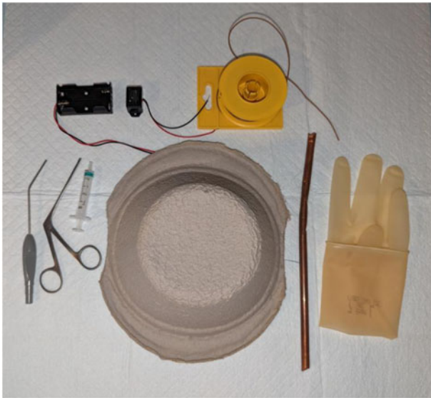
Figure 1. Components needed to build an enhanced low-fidelity ear simulator.

pipe and otomicroscopy instruments (aural microsuction and crocodile forceps). When the instrument tip touches the ear canal, which is painful and risks canal trauma in real patients, the buzzer alarms, thus providing objective performance feedback to the user. The instrument arms were painted to ensure that only the tip of the instrument set off the buzzer.