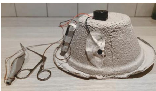
Figure 2. Enhanced low-fidelity ear simulator with buzzer for feedback.

There were eight non-expert participants (two medical students and six junior doctors). The overall average number of touches per attempt for the first model used was 6.13 on the first attempt and 2 touches on the fifth attempt. The overall average number of touches for the second model used was 4.5 on the first attempt and 0.88 touches on the fifth attempt.