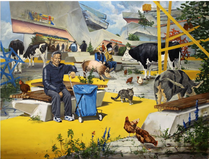
Figure 2. Bench (190x160cm). A representation of what a square could look like in a Zoopolis. Courtesy of Harmut Kiewert (2015).

The position upheld by Donaldson and Kymlicka is in alignment with “a feminist ethic of care [which] offers a liberatory framework that has the potential to complicate conceptions of dependency by paying attention to domesticated animals' agency as vital participants in and contributors to our shared world” (Taylor 2017, 207). As Adams and Donovan put it, we should be attentive to “what the animals are telling us—rather than to what other humans are telling us about them” (2007, 4). Donaldson and Kymlicka's crucial move resides in translating these new ways of regarding other