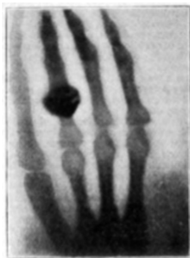
Figure 1 X-Ray image from Röntgen (1896, 276)

Röntgen's (or similar) experimentation will rest upon evidence gleaned from visual perceptual experience. Only the most skeptical of opponents would gainsay. (I am not claiming that we visually perceive X-rays.)