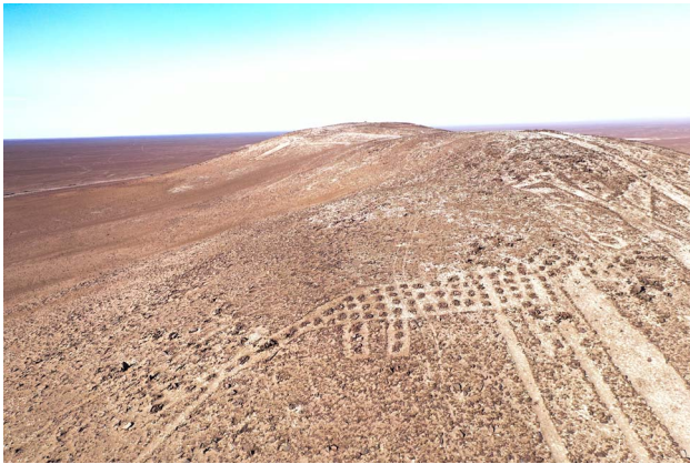
The newly discovered Andean cat geoglyph in the Atacama Desert, Chile.

most likely re-emerged as a result of the removal of sand by strong winds. A preliminary assessment dates the site to c. 500 B.C. The geoglyph has a total length of 62 m from the head to the termination of the tail. For comparison, the so-called Nazca cat geoglyph discovered in Peru in 2020 is 37 m long.