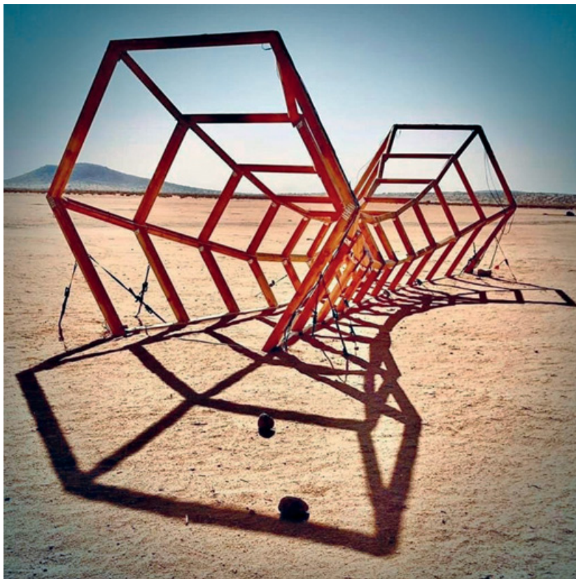
Figure 9 Emergence (2021) at Everywhen (Mojave Desert, California).

in the iconic Ellen Browning Scripps Park, and we did our best to finalize a site-specific piece that reflected the location's beauty (Figure 10).