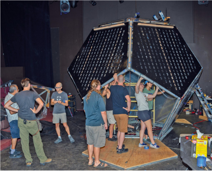
Figure 12 Unfolding Humanity (2023) Under Construction in USD's Studio Theater.