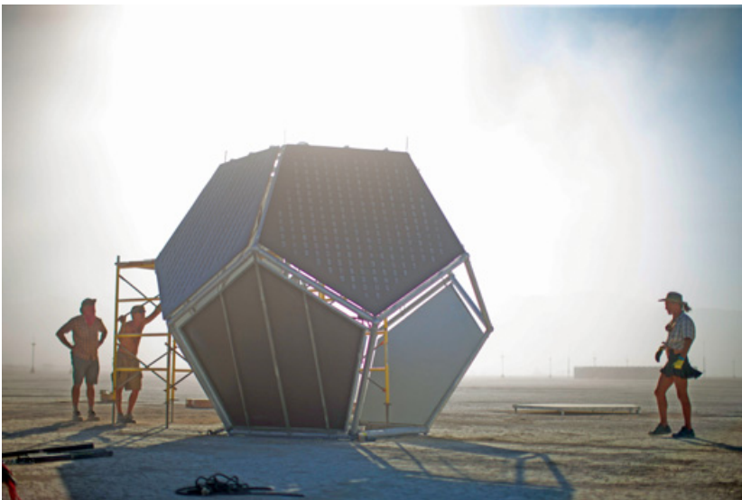
Figure 3 Installing Unfolding Humanity (2018), Burning Man (Black Rock City, Nevada).

In late August, the piece was installed at Burning Man, in the Black Rock Desert of Nevada, and in October, it was installed at Balboa Park, in San Diego, California. When all was said and done, more than eighty people had poured 6,500 hours bringing three students' ideas for an unsolved math problem into the world as a physical artifact (Figures 3 and 4).