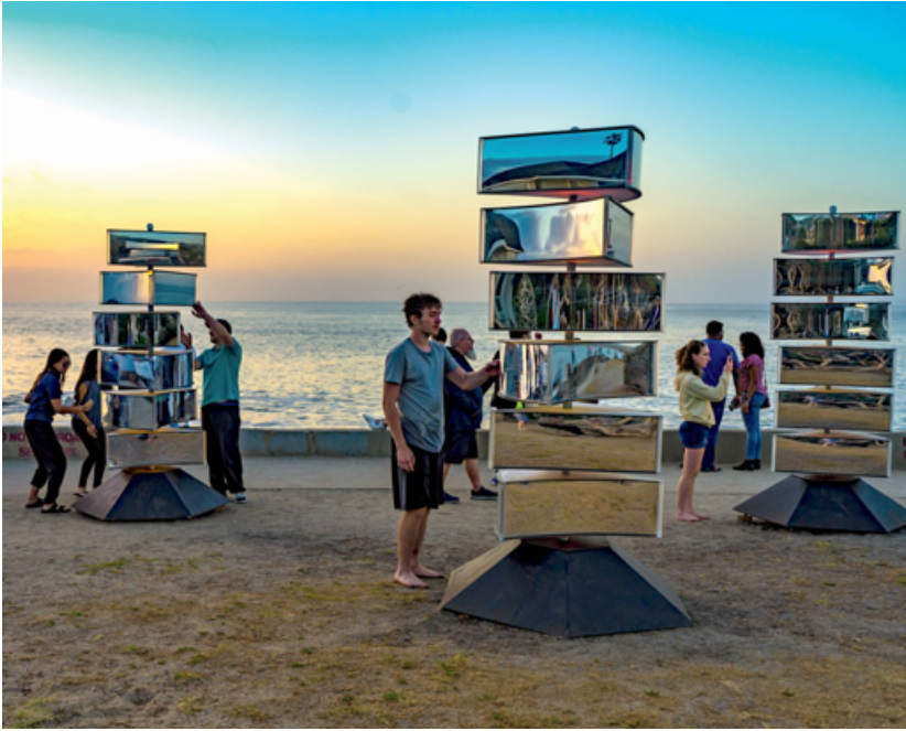
Figure 10 Reflexion (2021), Ellen Browning Scripps Park (La Jolla, California).

etc.) is the product of human agency. They exist because people decided to act, individually, collectively, civilizationally, and for better or for worse.