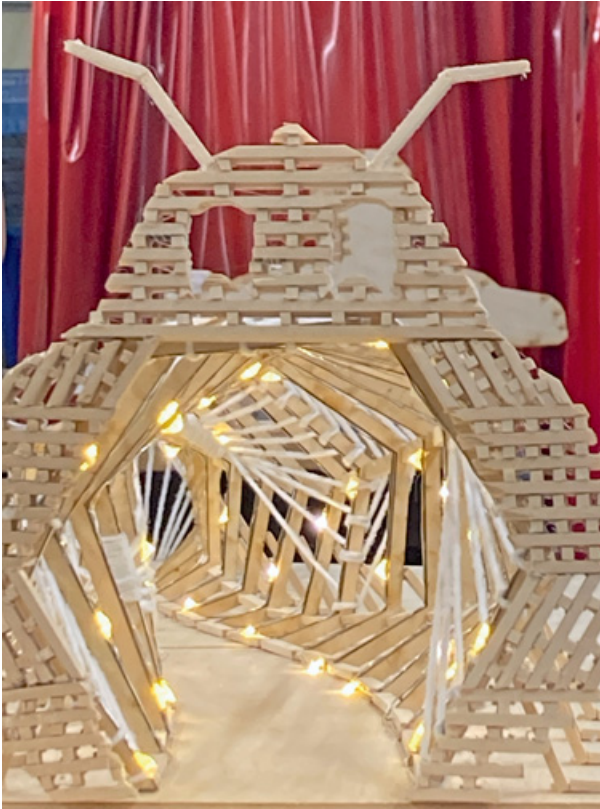
Figure 8 Original concept from engineering students (2021).