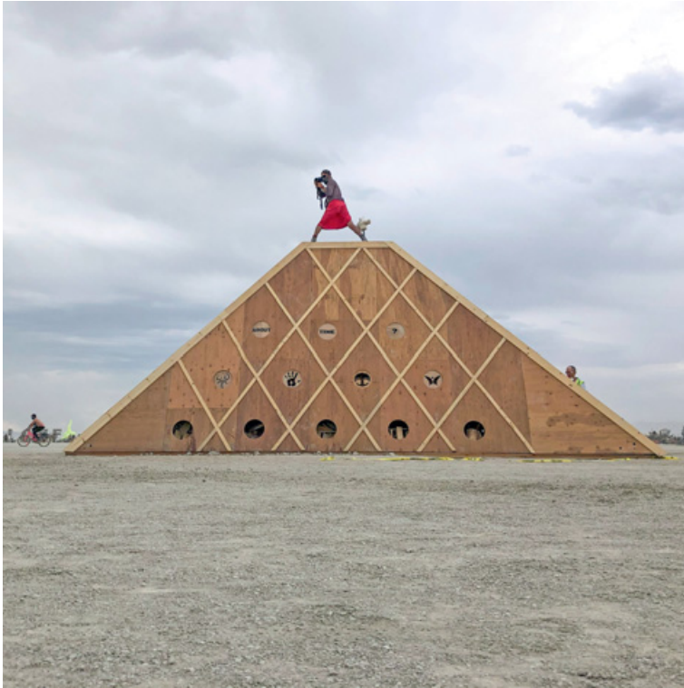
Figure 5 About Time (2019) at Burning Man, Side Profile (Black Rock City, Nevada).

Figures 5 and 6). Participants could climb inside and create their own message to the outside world. We were supremely pleased that the piece burned exactly the way we had planned (Figure 7 and via YouTube).