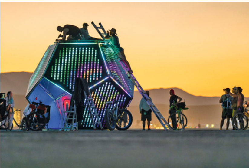
Figure 13 Unfolding Humanity (2023), Burning Man (Black Rock City, Nevada).