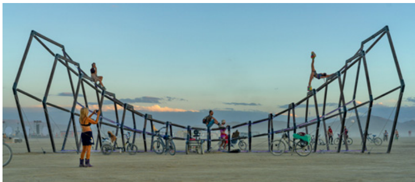
Figure 11 Re:Emergence (2022), Burning Man (Black Rock City, Nevada).