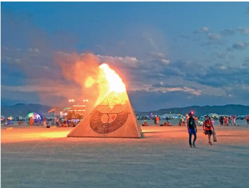
Figure 7 About Time (2019) at Burning Man, Burning (Black Rock City, Nevada).