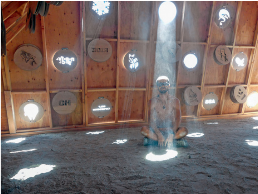
Figure 6 About Time (2019) at Burning Man, Interior (Black Rock City, Nevada).