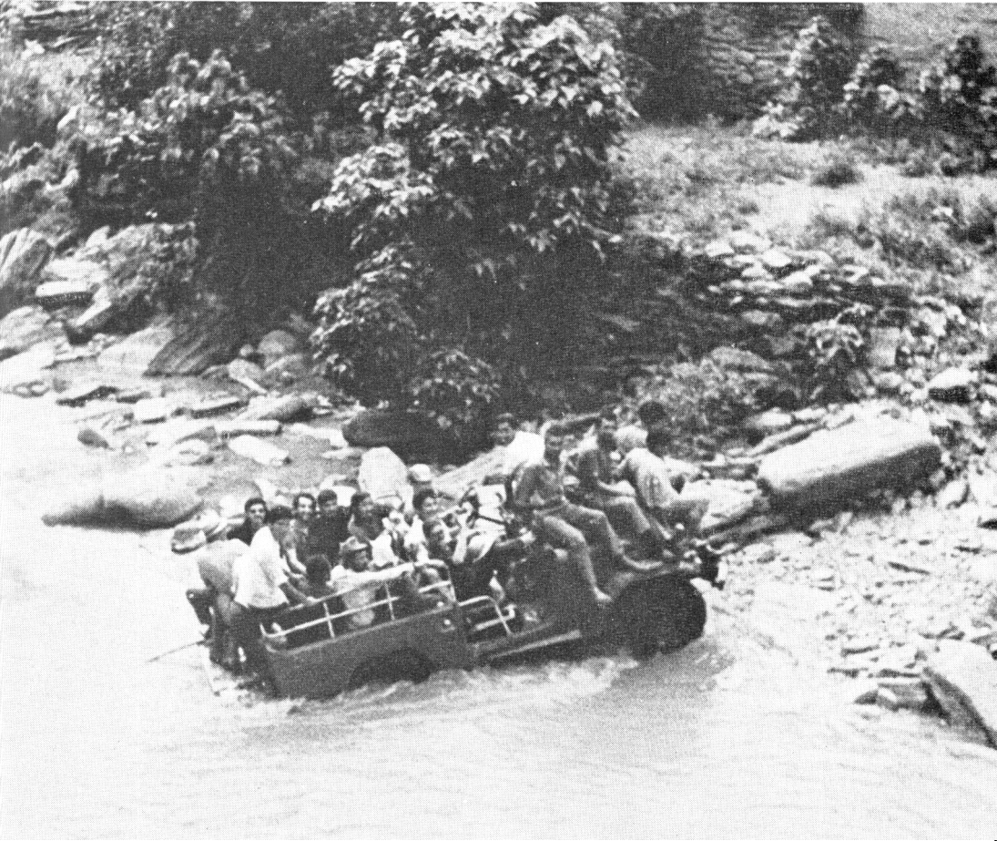
Guerrilleros, accompanied by the President of the Bolivian Red Cross, crossing a river on their way to La Paz.