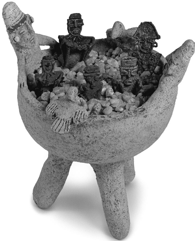
FIGURE 1.4 Tripod offering bowl with human and bird guardians, containing votive figures ( tunjos ) and emeralds, Colombia, Eastern Cordillera, 800–1600 CE (Muisca period). Los Angeles County Museum of Art, the Muñoz Kramer Collection, gift of Camilla Chandler Frost and Stephen and Claudia Muñoz-Kramer.

rag and wrapped cotton, all smoked', that was probably the object of all of these offerings. 163