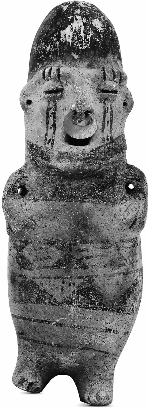
FIGURE 1.3 Ceramic figure with facial decoration and gold alloy nose ring ( santuario? ), Colombia, Eastern Cordillera, 800–1600 CE (Muisca period). Note the geometric design painted on the body of the figure, likely depicting a painted manta. Private collection.