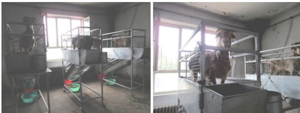
Figure 1. The individual metabolic crates with a faeces collection system.

The germination percentage of seeds from the simulated ingestion study was compared with that of non-ingested seeds. All seeds were disinfected by immersion in a 1% sodium hypochlorite solution for 2 min and then rinsed with sterile distilled water for 10 min. The seeds were placed on moist filter paper in 5-cm Petri dishes. Each Petri dish contained 25 seeds. There were four replicates per treatment. The incubations were conducted in controlled environment chambers with 16 h light at 25°C and 8 h of darkness at 15°C. The filter paper was remoistened with distilled water as necessary. The incubation conditions allow for the germination of a large range of plant species (Picard et al. , 2015). The dishes were examined daily. Seeds were considered to have germinated when the root was 1–2 mm long. Seeds that had germinated were counted and then removed from the dishes. The germination percentages in this paper are the average of the three incubation times (i.e. 22, 34 and 46 h).