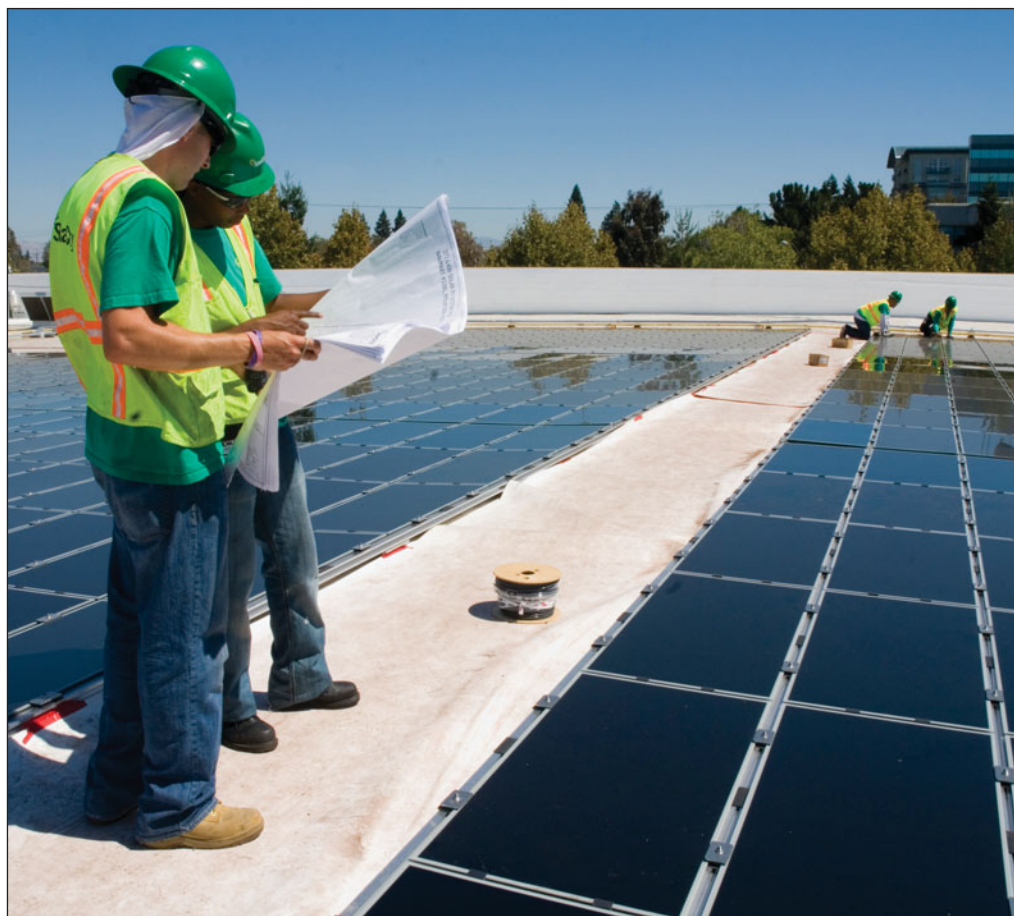
Thin-film solar panel-maker First Solar has a voluntary buyback program for its modules, which contain toxic cadmium. Something similar could be envisioned for lead-containing perovskite solar panels.

Several research groups are looking at potential replacements for lead-based perovskites for solar cells. Tin is one potential substitute for lead in perovskites. Research groups at the University of Oxford and Northwestern University have made methylammonium tin iodide solar cells. But so far, these have