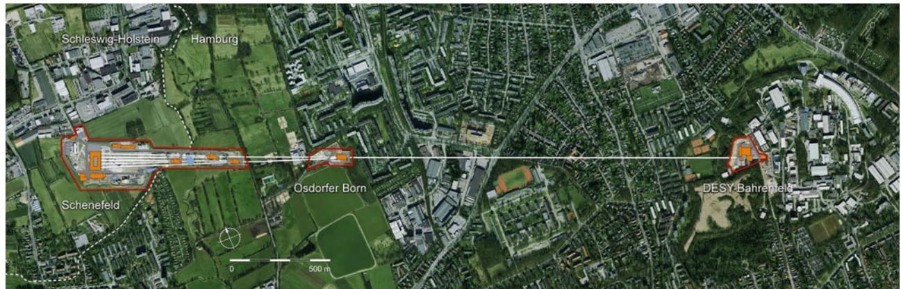
Figure 3. Layout of the European XFEL facility; the path of the underground tunnels is superimposed on a map of the northwest part of Hamburg and the town of Schenefeld in Schleswig–Holstein.