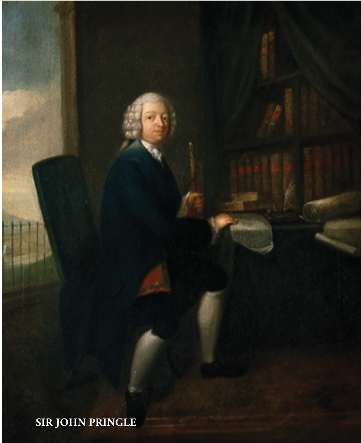
SIR JOHN PRINGLE