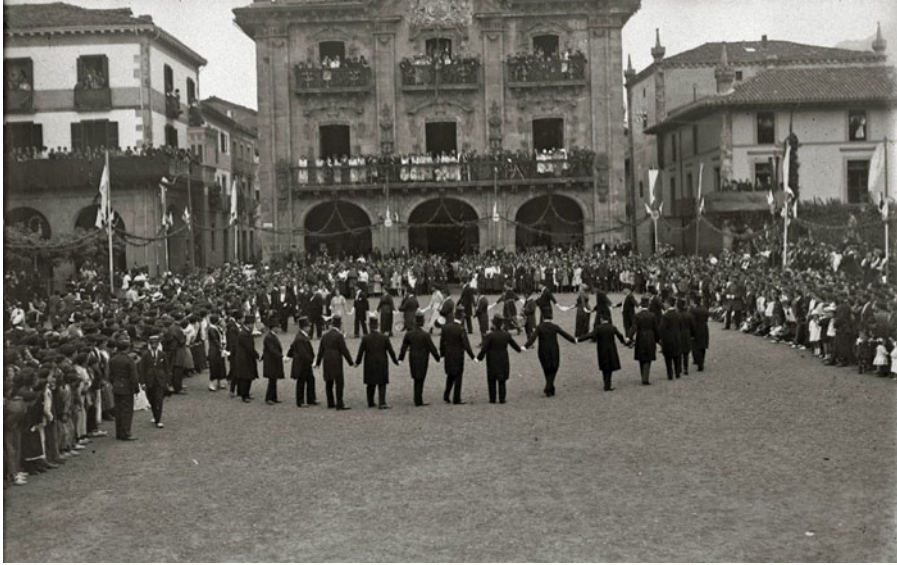
Figure 1. Celebration of the International Congress on Basque Studies by the Basque Studies Society in Oñati, Gipuzkoa, February 11, 2017.