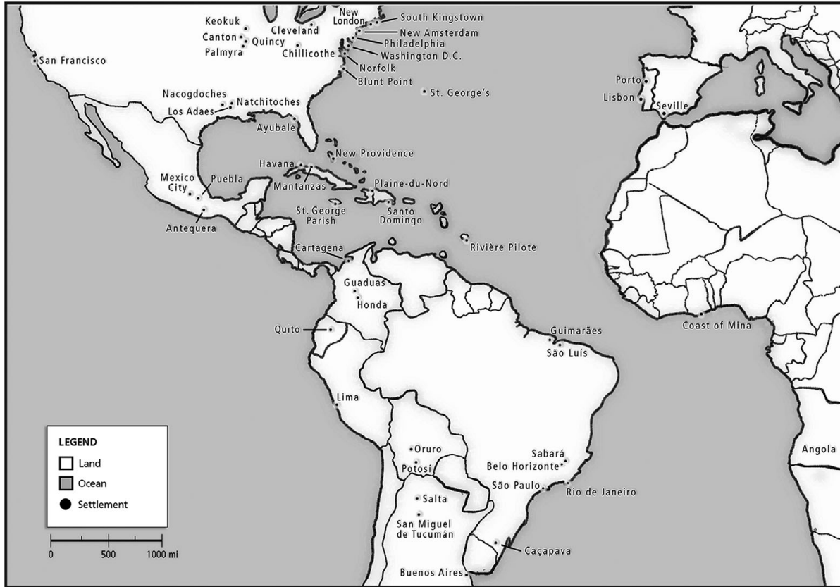
FIGURE 1.3 Places where subjects lived