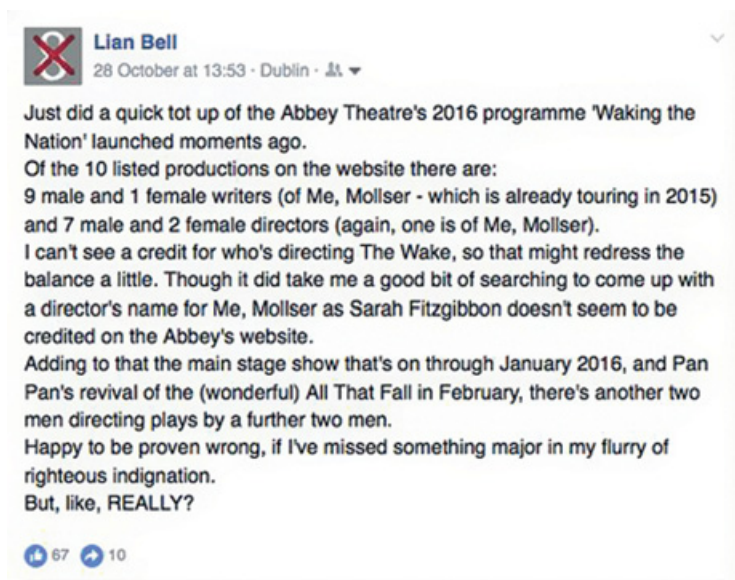
Figure 4 Lian Bell's first Facebook post in response to the announcement of the Abbey Theatre's 'Waking the Nation' programme on 28 October 2015. #WakingTheFeminists collection, courtesy of the National Library of Ireland.