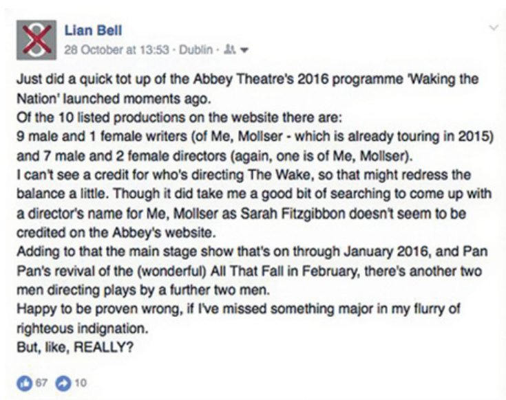
Figure 4 Lian Bell's first Facebook post in response to the announcement of the Abbey Theatre's 'Waking the Nation' programme on 28 October 2015. #WakingTheFeminists collection, courtesy of the National Library of Ireland.