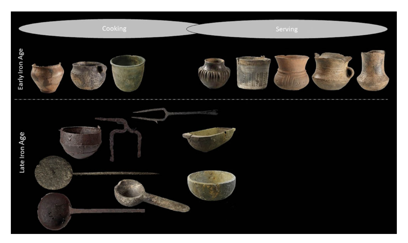
Figure 3. A simple overview of how culinary artefacts from the Iron Age in Norway invoke different parts of the meal and produce a sliding scale from serving to cooking. (From Bukkemoen 2021.)

meal (Fig. 3). The sorting revealed a sliding scale in emphasis, from equipment made for serving to cooking, following the change from ceramics to iron and soapstone, indicating a significant change in the meal as a repertoire of households and their negotiation of meaning in social practice (Bukkemoen 2021, 108–9). This reorientation of meals as a social practice has been further explored through craft communities and the spatial location of culinary practices.