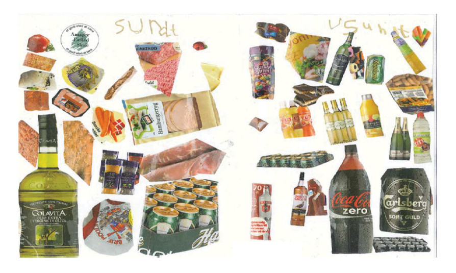
Figure 3. Examples of students' placemats: at left, healthy (with several pork products); at right, unhealthy.

We see more nuances when we look at children's meaning-making processes through their conversations, such as the conversation about food preferences, shown in example 1, between students Oliver (Danish background),