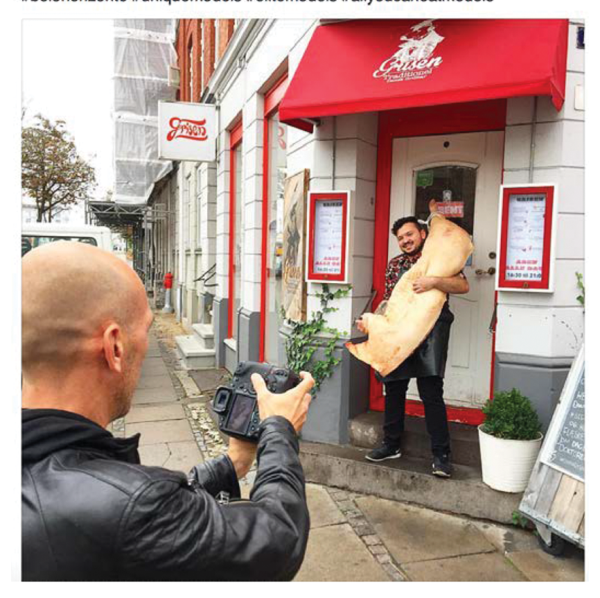
Figure 6. Grisen photoshoot for the supermarket chain Irma (reproduced with permission from Umut Sakarya).

#photoshoot #modeling #helsinki #deutschland #manzara #meer #finland #sweden #stockholm #norway #see #view #fit #model #mode #posing #girl #fashion #lingerie #sensual #sexy #femalemodels #instabeauty #models #beautiful #nextdoormodel #fitnesswoman #fitnessmodel #modafeminina #belohorizonte #uniquemodels #elitemodels #allyoucaneatmodels