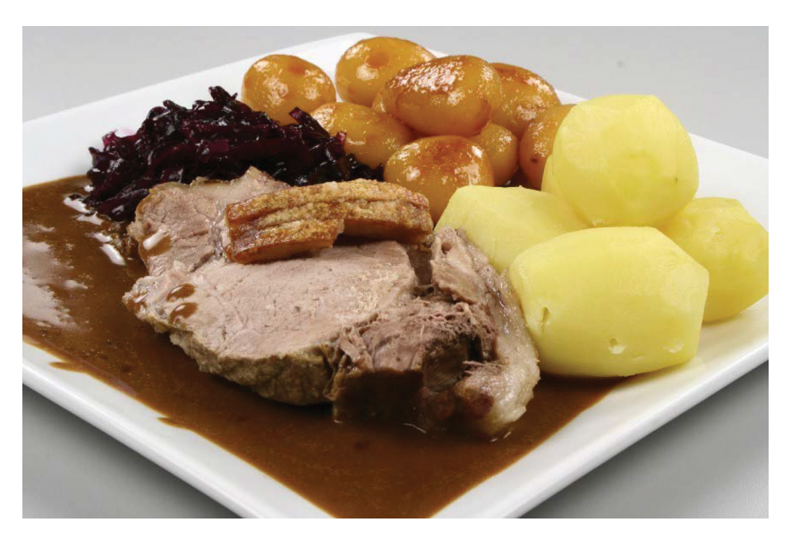
Figure 1. A Danish pork roast dinner.