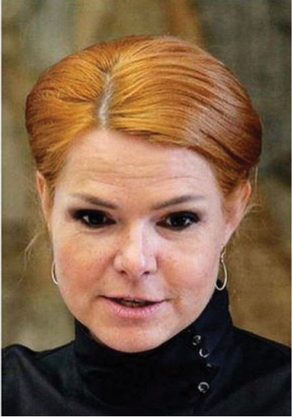
Figure 2. Social media meme comparing the Minister of Integration with a hamburgerryg .

one ought to believe that it was a sort of sacred food, which you have a religiously conditioned and national plight to consume. It is regarded as such an important component of our popular (folkelige) life that you may actually wonder why you do not demand the annoying slice of cardboard served at the Communion be replaced by the meatball."10 The comparison between a food item, the discourse of national values under threat, and a sacred sphere turns the case into mockery of the pork-promoting nationalists. After all, the pig is not a sacred animal in Denmark, after all, being Danish is not a religion. The editorial also articulates nationalism formulated through the assertion of food as national and cultural values—as almost as esoteric and irrational as religion. At the same time, the editorial walks a dangerous line by introducing religion, as it is far too easy to construe the conflict as based on religion. A humorous take on the Meatball War came from a social media meme where the Minister of Integration (Inger Støjberg, from the liberal party Venstre) was compared to an old-fashioned pork dish hamburgerryg (fig. 2). Her strong anti-multiculturalist and anti-immigration stance was treated as identification with pork, this identification being underlined visually. Although the central status of food (and pork in particular) for the definition of