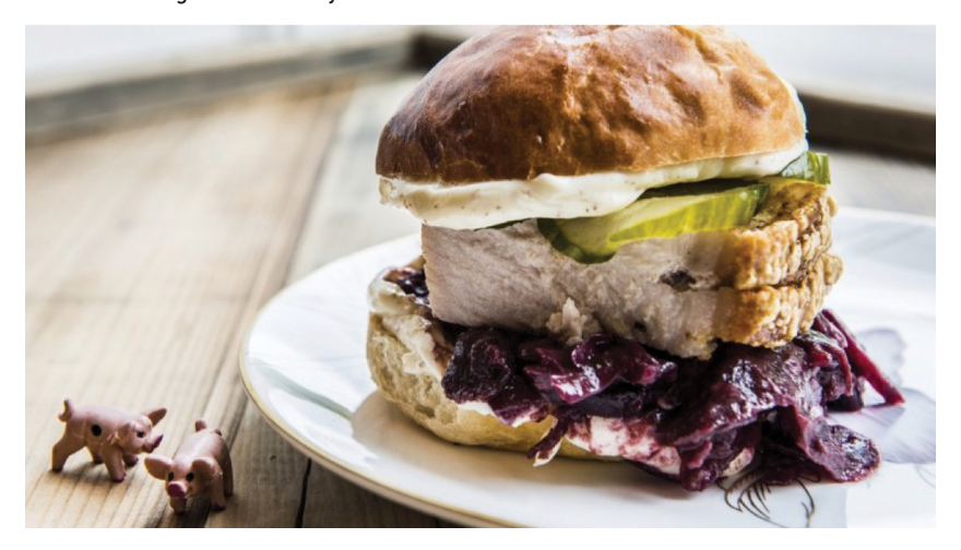
Figure 7. A pork roast sandwich from Grisen (reproduced with permission from Umut Sakarya).

ways (see example 7). Many came for the pork sandwiches ("I just love pork") (see fig. 7). Almost all of them described the place as hyggeligt 'cozy, convivial, warm' (see fig. 8). Hygge(ligt) was combined with other adjectives such as homely, old-fashioned, Danish, and authentic, and the decorations were seen as "different," that is, unconventional, atypical. The queen, the tablecloths, and the candles were mentioned as signs that generated these understandings. Umut's Turkish background was never taken up: