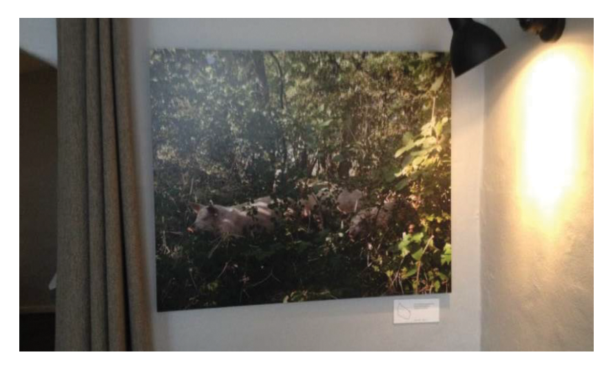
Figure 4. A forest pig pictured in a high-end Copenhagen restaurant

In addition to these pictures and texts, staff interactions with guests also contributed to the restaurant's branding, as in example 3. When talking to guests, the waiter often situated the pigs at a particular farm, Vasagaard. This strategy drew on the understanding that a named place is better than an unnamed place (Johnston and Baumann 2015), and the naming of the place, in addition to the