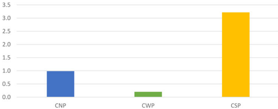
Figure 2. Overall frequency of K-suffixes per 1,000 words.

that K-suffixes in these phases are not associated with a predictable and commonly recurring function, we would not expect a uniform frequency of use. Indeed, frequency of evaluative usage may simply be a matter of genre.