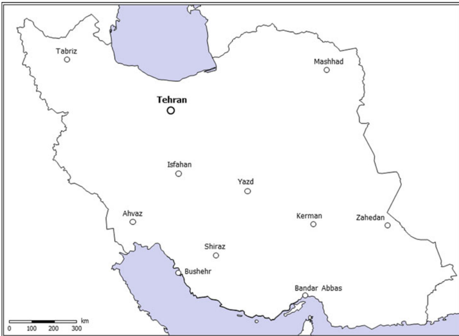
Figure 1. Location of the data for Contemporary Spoken Persian.

semantic modification, e.g., kanīzak , ‘girl’, xāharak , ‘sister’, mardumakan and šamšērak ‘sword’. 27 Gindin, in an unpublished study on Early New Judeo-Persian, mentions -ak as a diminutive suffix, such as in “ jūyz-ak ” – a diminutive of jūy “river.” 28