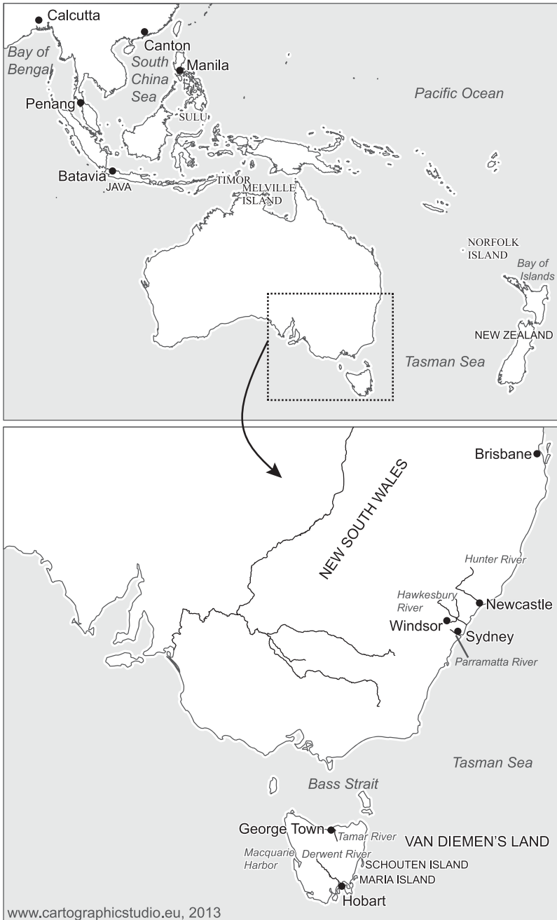
Figure 1. New South Wales and Van Diemen's Land, with the principal locations of convict piratical seizures, 1790–1829. The author acknowledges Hamish Maxwell-Stewart for the draft of this map.