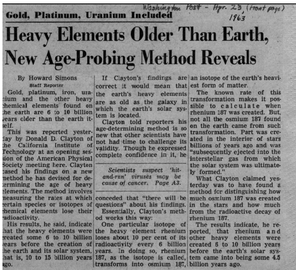
Figure 1 The front page of the Washington Post of 23 April 1963 where the proposal of using the Re/Os clock by Don Clayton was reported after the announcement at the meeting of the American Physical Society. The story, while written in non-specialistic language, correctly reports the basic principle on which the clock is based.