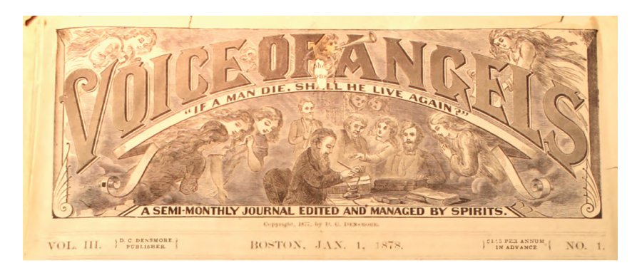
Figure 7. Masthead of the first issue of Voice of Angels in 1878