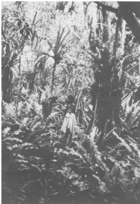
Undisturbed coastal rain forest ( Pandanus spp. dominant) in O Le Pupu-pu'e National Park.

The O Le Pupu-pu'e National Park contains a fairly diverse representation of native avifauna, although some of the most threatened species, for example the tooth-billed pigeon, have not been recently recorded there. It is unlikely that this park alone will be able to ensure long-term survival of the 'Upolu forest birds if the remaining adjacent mountain forests continue to be degraded or converted to commercial forestry and agriculture. Although the park is an impressive start, particularly for a small, Third World nation struggling for economic and social development, the ultimate fate of the Samoan avifauna will probably rest with long-term land use decisions made on the larger island of Savai'i. A national park has been proposed for central Savai'i, incorporating Mt Silisili (1859 m) and adjacent areas covered by the partially revegetated, 200-year-old A'opo lava flow (Holloway and Floyd, 1975). Again, this