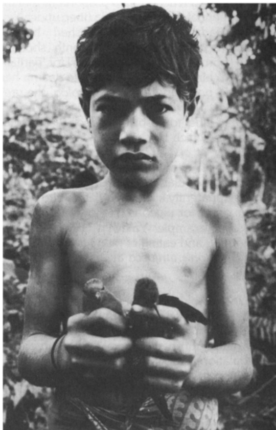
A young Samoan displays the fruits of his slingshot hunting at Asau Savai'i: a blue-crowned lory (left) and a cardinal honeyeater (right), both taken for food.

Sling-shots are commonly used today to stun or kill small native land birds such as the blue-crowned lory; segasega mau'u or cardinal honeyeater Myzomela cardinalis nigriventris ; and 'iao , the wattled honeyeater Foulehaio carunculata . Boys and young men stalk their prey near the coast under large flowering trees (for example, Erythrina spp. and Syzygium sp.) on which the birds come to feed. We observed this activity frequently near the village of Asau on the north-west coast of Savai'i. We also saw, in other villages on Savai'i, young children holding small birds whose feathers had been plucked. We were told that lorries and honeyeaters were commonly eaten by the younger Samoans, but birds are also sometimes kept as pets. Although widespread hunting with sling-shots may have some impact on the land birds, it certainly does not pose as significant a threat as does the contemporary, widespread use of guns.