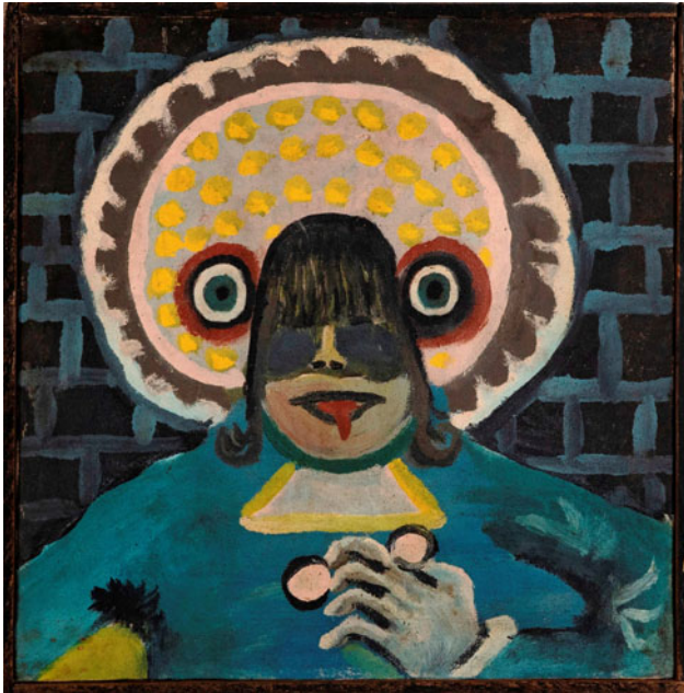
Fig. 1. Largactil tablets [ Os Comprimidos de Largactil ]. Oil on wood panel, 35, 5 cm × 35,5 cm, date 1963. Copyright: Private collection.

where 2000 works were shown. This book served as a source of inspiration for studies carried out all over the world in the 1960s and 1970s. Volmat's use of the expression 'psychopathological art' at the time certainly didn't have the stigmatising flavour it has now. The work of this psychiatrist and his colleagues led to the development of art collections and to the promotion of artistic creation by patients, whose products were considered as 'laboratory material' for study.