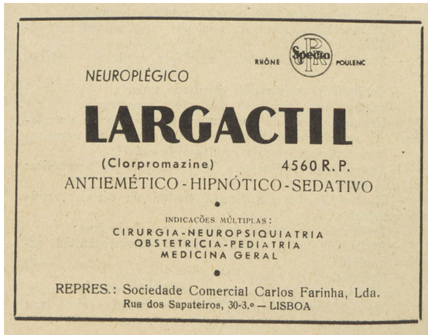
Fig. 2. Largactil advertising, in Jornal do Médico , XXIII, 587, 1957, p.1042.