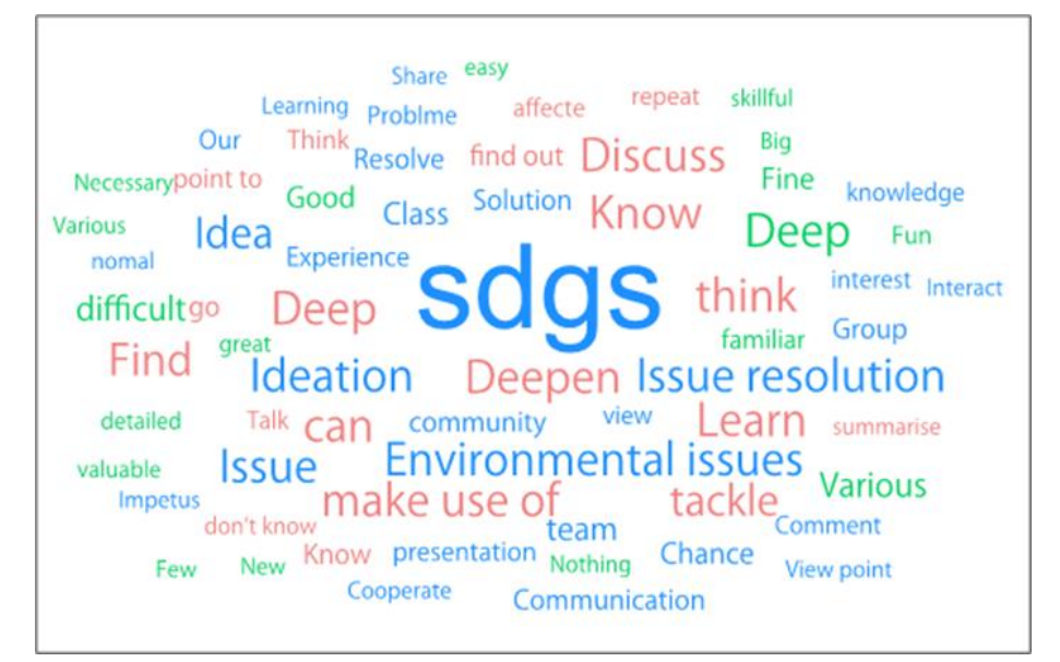
Figure 3. Students' responses illustrative model

Students' survey responses were also gathered through text mining (Figure 3), and the results are organized in descending order of scores. The scores reflect the "importance" of each word. Notably, for students, nouns such as SDGs, environmental issues, ideation; the verbs know, think, discuss, deepen; as well as adjectives such as difficult and deep; were identified as significant. The term "deep" appeared frequently in both verb and adjective forms.