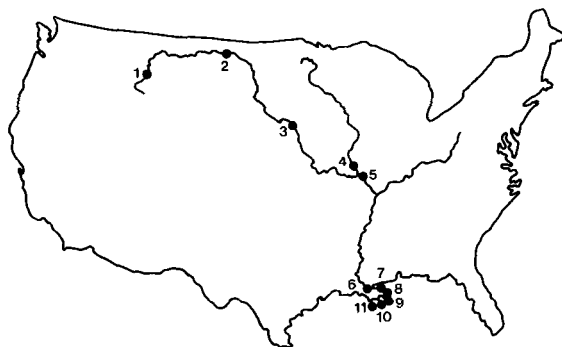
Figure 1. Sampling sites of Mississippi River and Gulf of Mexico samples. See Table 1 for exact locations.

Two sets of samples were used. The first set was bottom sediments of the Mississippi River and of the inner shelf of the Gulf of Mexico immediately off the Mississippi River. The Gulf samples were from the sea floor off Eugene Island and Grand Isle. The location of these samples is described in Table 1 and shown in Figure 1. Nine samples from the river and two sea-floor Gulf samples were used to estimate the \delta^{18}\text{O}_{\text{initial}} values of the Gulf samples. Only <0.1\text{-}\mu\text{m} fractions of the samples were used, because the mineralogy of this size fraction was generally simpler than that of coarser fractions and because they were more sensitive than