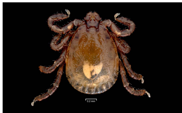
Adult male Ryukyu rabbit tick Haemaphysalis pentalagi .

An ex situ insurance population of H. pentalagi has been established at Hokkaido University from individuals collected on Amamioshima. This population has successfully reproduced in captivity and had completed one full life cycle as of May 2024, with the second captive-bred generation now maturing. A husbandry manual for this