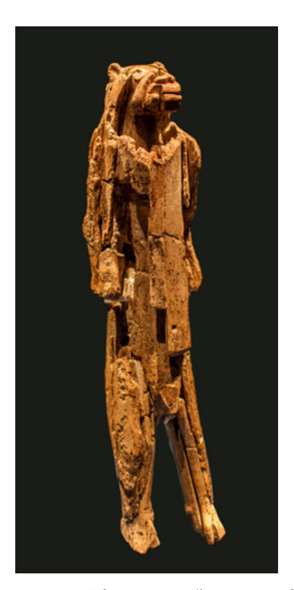
Figure 1.5 The Lion-man ('Löwenmensch') from the Stadel cave in Hohlenstein in the valley of Lone (Germany) ca. 35,000–40,000 BP.

the Chauvet Cave show that the boundary of human and animal is not firmly fixed, but is forever breaking down.