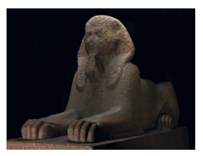
Figure 1.3 Red granite Sphinx of Ramses II (nineteenth dynasty, ca. 1293–1185 BC). Sacred enclosure of the temple of the god Ptah, Memphis. 362 \times 145 cm. University of Pennsylvania Museum, E12326.