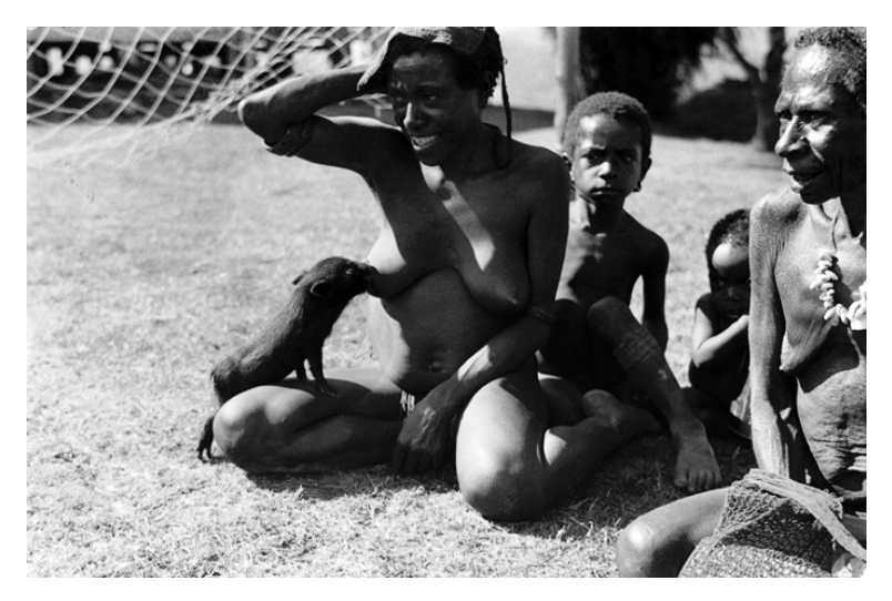
Figure 1.6 Chimbu woman breastfeeding a piglet, 1939. Peter Skinner: Ian Skinner Collection/Science Source. 1494781.

As far as we can tell from ethnographic comparisons and from the testimony of rock art and other artefacts of early human culture, from the earliest times of human consciousness animals have been present as creators, ancestors, guides and sometimes competitors. The animal dimension of human experience is pervasive and finds expression in the deepest structures of human society, expressed in song, dance, figural art and combined performances. It is enormously powerful, because if humans exist in a here-and-now, we also exist in a there-and-then. In the Dreamtime animals crossed the land, leaving their traces in lake, stream, hill and cave, which we create afresh in dance, song, initiation and ritual. At the corroboree all these performances cohere. Peter Sutton sees this human incarnation of the Dreaming as temporary, in contrast with the Dreaming itself, which 'pre-exists and persists'. 32 The contrast, however, is potentially misleading. Animal and land spirits are channelled and accessed by human participants led by their shaman in the coroborree, For example, in an episode, recorded in 1938, the old barnmarn (poet, medicine man and shaman) Allan Balbungu teaches other Worrora men his songs, after which he passes into a trance described by one of the others present, Ngarinyin man David Mowaljarlai: