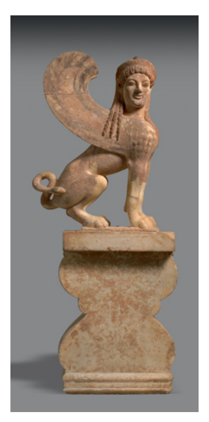
Figure 1.2 Marble capital and finial in the form of a sphinx, ca. 530 BC. Attic. Parian Marble. Height with acroterion 142.6 cm. Metropolitan Museum of Art, 11.185d, ×.

carries an inscription addressed to the sphinx guarding the burial: 'Dog of Hades, whom do you watch over, sitting over the dead?' This sphinx, at least, is a protector, but in the fifth century there were also depictions of Oidipous killing the sphinx. In this tradition, as in the literary accounts, the creature is an agent of death rather than a guardian. Nor can we solve the riddle of the sphinx by simply treating it as a Near Eastern figure transplanted to a Greek setting. Petit observes that 'We have long known that the Kerûbhîm ("cherubim") of the Bible are represented in the form of the hybrid called "sphinx" by the Greeks.' But what prompted the Greeks to adopt the Cherubim, and did the Greek sphinx mean the same thing as its antecedents? Origin is not explanation. Furthermore, symbols can lose their meaning and become just images. When Kleitias arranged his