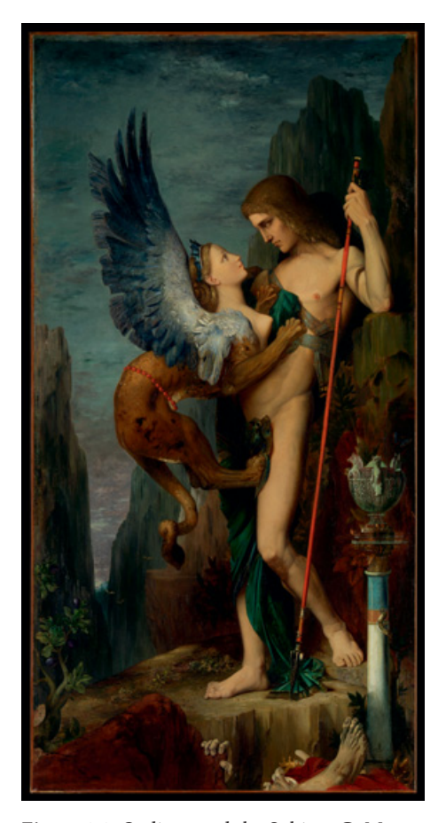
Figure 1.1 Oedipus and the Sphinx. G. Moreau. 1864. Oil. 81 1/4 \times 41 1/4 in. Metropolitan Museum of Art, 21.134.1.

attractive, full of menace, a symbol of all that threatens male control. Ingres' 1808 painting of the same episode is less feverish, but takes on added significance when set against the artist's lifelong struggle to free himself from his father's influence. As Posèq has shown, the painting is an Oedipal treatment of an Oedipal subject.<sup>2</sup>