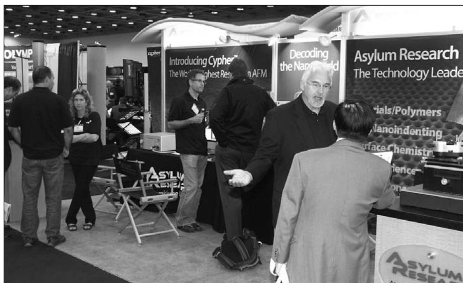
MRS Meeting attendees meet with equipment exhibitors to explore new products.