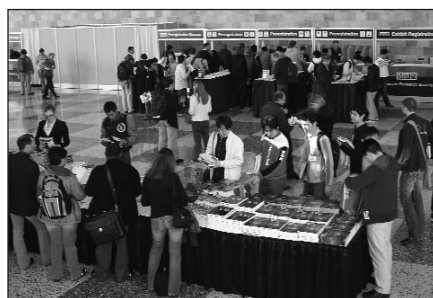
2009 Materials Research Society Spring Meeting.