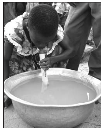
The LifeStraw® Personal portable water purifier, designed to provide clean and safe drinking water to people outside their homes, was displayed by Vestergaard Frandsen in a special exhibit on materials for the developing world during the MRS Spring Meeting.

Engineers Without Borders, based at the University of California, Santa Barbara, and a special undergraduate study-abroad program in the Department of Materials Science and Engineering at Iowa State University were also represented. The key to both programs is for students to apply the principles of technology that is appropriate to the environmental, cultural, and economic situation for (Continued on page 612)