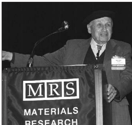
Nobel laureate Walter Kohn of the University of California, Santa Barbara gave the plenary address on the topic of materials challenges in solar energy.