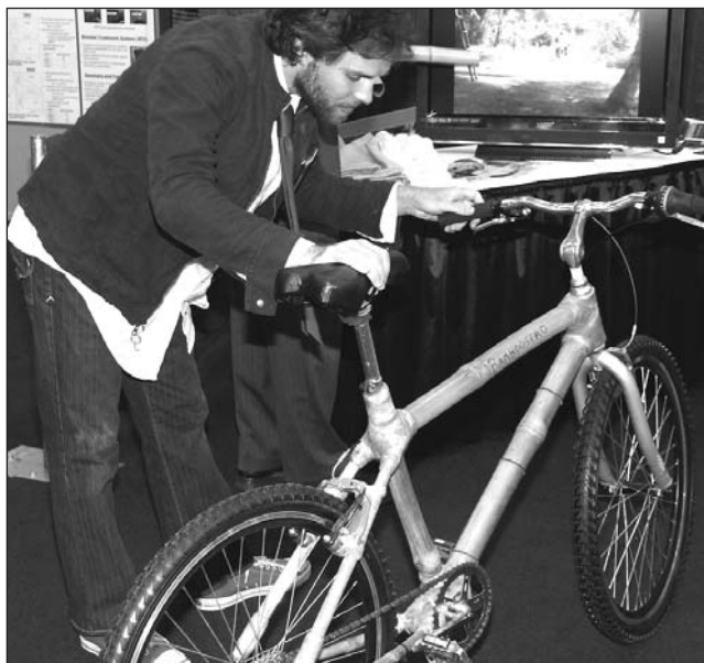
An MRS Spring Meeting attendee examines a bamboo bicycle made in Ghana by Bamboosero. The bicycle uses locally grown bamboo joined with a sisal/epoxy composite. The goal is to create self-sustaining businesses that help the developing world break the cycle of dependence on Western aid.