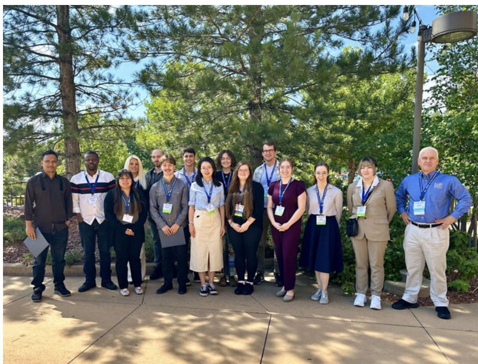
Figure 1. 2024 Robert L. Snyder student grant award winners.

Ultimately, the following presenters were named winners: