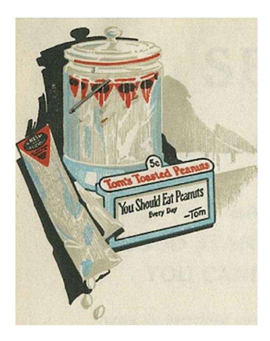
Figure 3. Letterhead depicting Tom's countertop marketing material.

was that Huston pushed peanuts all over the United States in "tall, slender bags with a red seal at the top." ^{91}