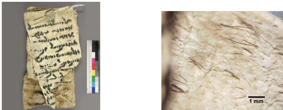
FIG. 1. Left: Leather document, courtesy of the Bancroft Library, University of California, Berkeley. Right: Fragment of a leather document showing animal hairs.