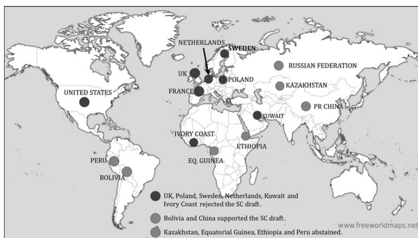
Figure 2 Security Council draft resolution proposed by the Russian Federation