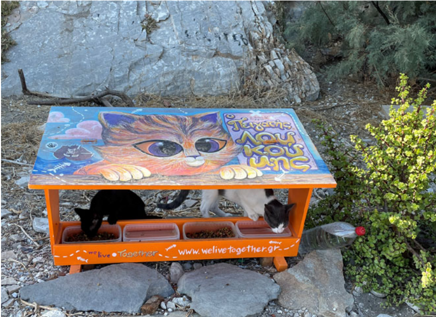
Figure 2. Cat café in Ermoupoli, Syros.

animality as injurious, becoming a loose signifier, a fungible concept, that invites violence of all sorts” (2015, 22). Given the obvious connections between violence against animals and violence against marginalized humans, it follows that any attempt at creating feminist solidarities across species lines must begin from an anti-racist politics that understands both animals and humans as agents of decolonial resistance.