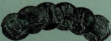
Gold Medal Allahabad 1910.

Paris 1900, Brussels 1910, Buenos Aires 1911.