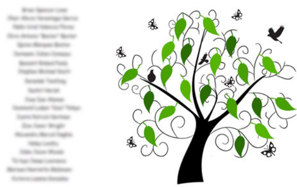
Figure 4. Adapted tree for virtual Good Grief and Chocolate at Noon.

moving GGCN to a fully virtual format. Chocolate is distributed to the pediatric units in advance of the programs. To replace the paper leaves and tree, a digital version of the tree and leaves is shared via Zoom. It includes animation so that when a patient’s name is read, a leaf floats from the patient’s name to a branch on the tree (Figure 4). Staff members who have joined remotely then take turns sharing stories and memories of that patient. For the second half, the guest speaker joins the Zoom session to present the didactic portion.