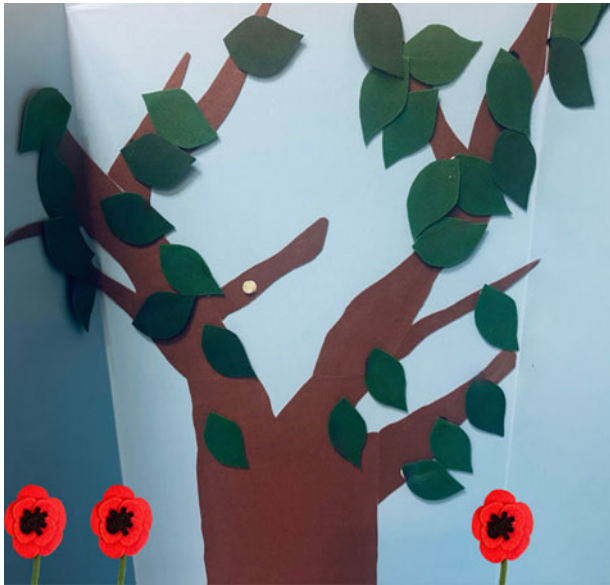
Figure 3. Tree for Good Grief and Chocolate at Noon.

is then placed on a faux tree to honor them (Figure 3). After the sharing is finished and all names have been placed on the tree, staff who chose a flower share their story or concerns. They then place the flower at the base of the tree, creating a symbolic flower garden. A period of silence follows.