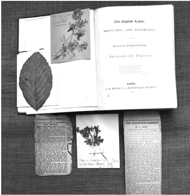
Figure 1 Our English Lakes, Mountains, and Waterfalls, as Seen by William Wordsworth. Photographically Illustrated (London 1864). Cuttings and title page.

head, and we find amid the fading leaves a place for prayer [...] that some of them may come back again—that we may see them with these eyes that have wept so much; see them coming, with kind, living hands held out to us, along the grassy paths of our garden.