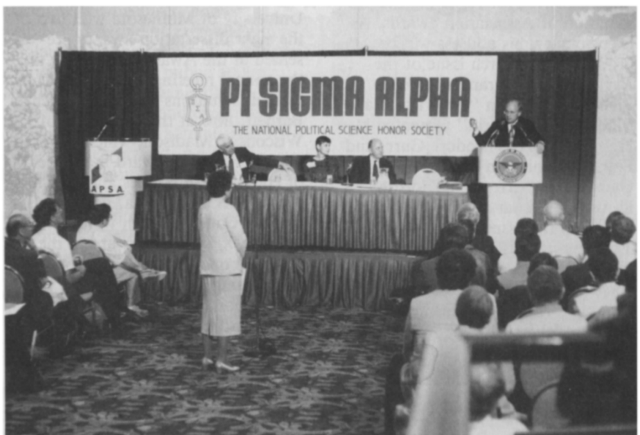
Secretary of Defense Richard Cheney delivers first Pi Sigma Alpha Lecture.