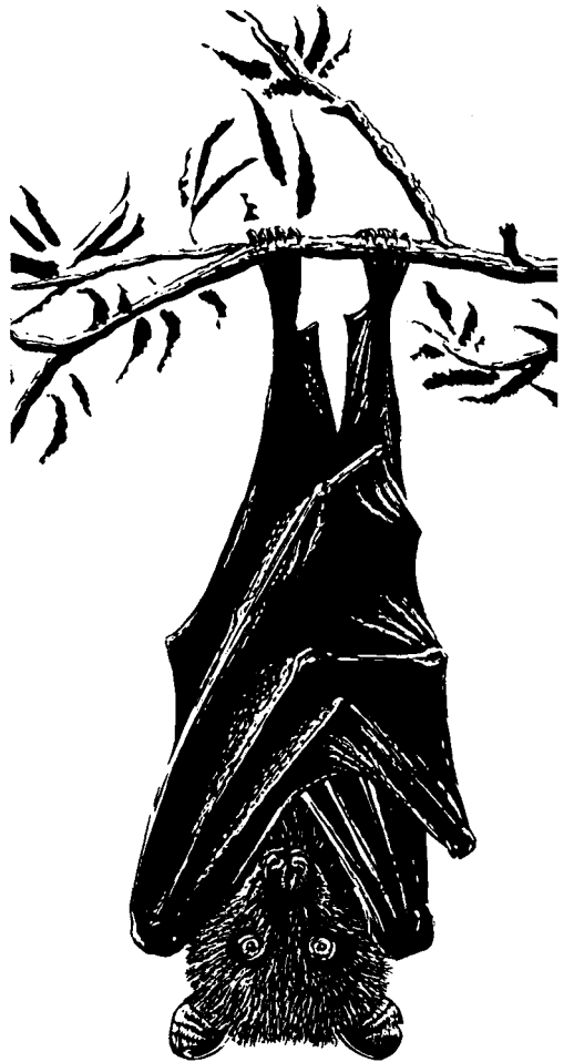
Pteropus livingstonii .

On Anjouan, counts were also made at a feeding site near the Hombo roost, 'Bistro 21', in both years. This was one of the sites where catching took place.