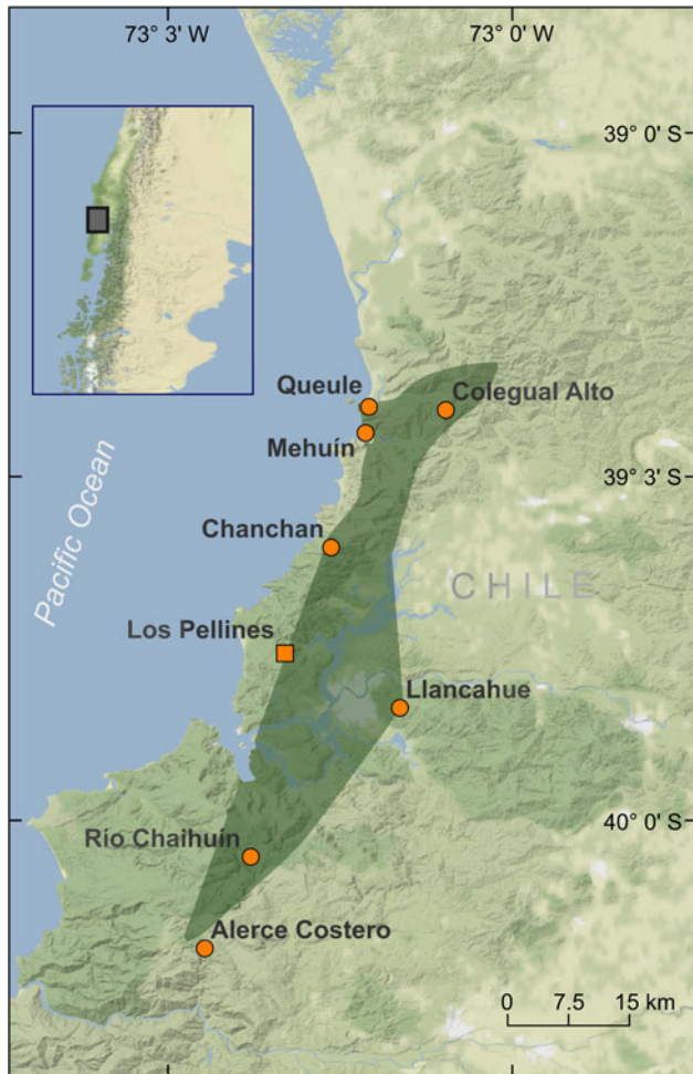
FIG. 1 Previously known localities (circles) and new locality record (square) of Barrio's frog Insuetophrynus acarpicus in southern Chile. The shaded area represents the extent of occurrence of Barrio's frogs from the species' IUCN Red List assessment (IUCN SSC Amphibian Specialist Group, 2018). We extracted geographical coordinates of previously known localities from Contreras et al. (2020), except for Queule, which we obtained from Méndez et al. (2006).

for residential development in nearby native forests, (8) neighbouring exotic tree plantations, and (9) climate change (Rodríguez et al., 2022).