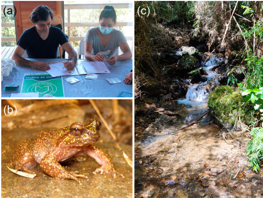
PLATE 1 (a) Signing of a voluntary land conservation agreement between the landowner (co-author SM) and the NGO Ranita de Darwin for the creation of the protected area Refugio de Ranitas Aldea del Viento, Los Pellines, Valdivia, Chile. (b) An adult Barrio's frog Insuetophrynus acarpicus found in this protected area. (c) The high-gradient stream where the species occurs.

unknown (Fig. 2, Supplementary Material 1), limiting our capability to implement evidence-based conservation actions.